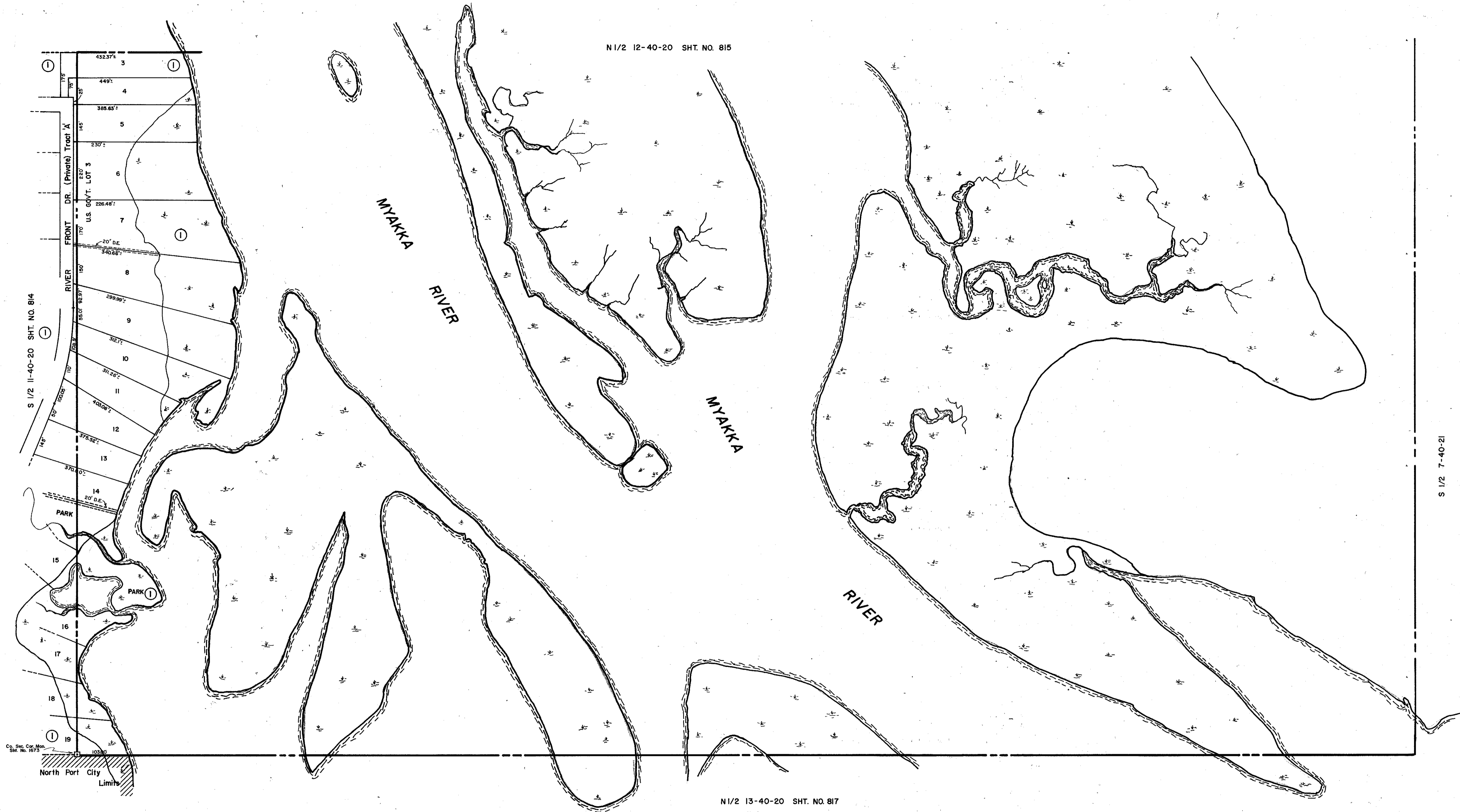
SUBDIVISION INDEX I. MYAKKA COUNTRY P.B. 28/16