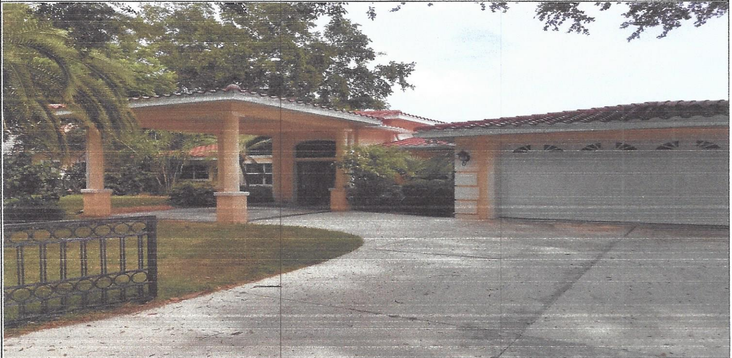
Photo One Caption 1332 Quail Drive - Front Photo

If using the Elevation Certificate to obtain NFIP flood insurance, affix at least 2 building photographs below according to the instructions for Item A6. Identify all photographs with date taken; "Front View" and "Rear View"; and, if required, "Right Side View" and "Left Side View." When applicable, photographs must show the foundation with representative examples of the flood openings or vents, as indicated in Section A8. If submitting more photographs than will fit on this page, use the Continuation Page.