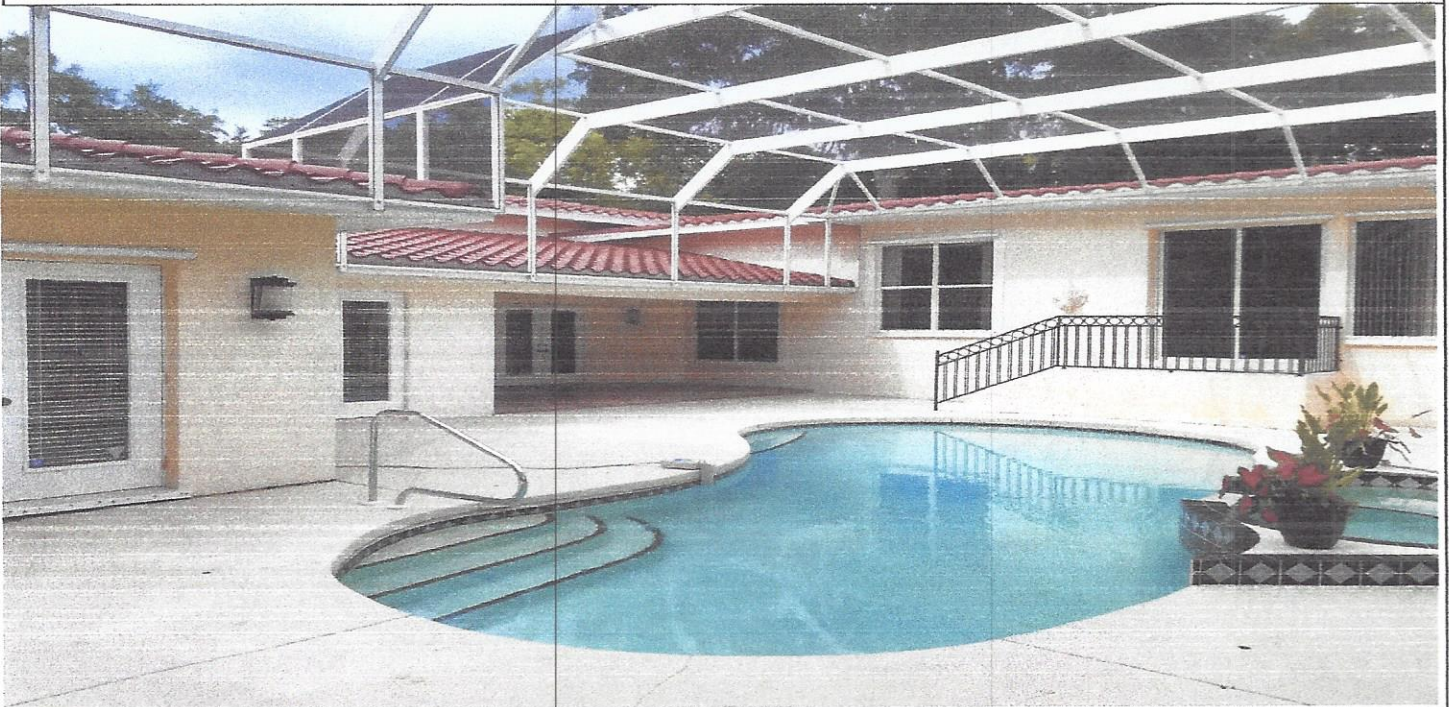
Photo Two Caption 1332 Quail Drive - Rear Photo