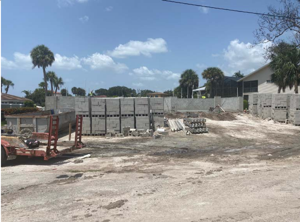
Photo 1 Caption Front View Date Taken 8/25/21

If using the Elevation Certificate to obtain NFIP flood insurance, affix at least 2 building photographs below according to the instructions for Item A6. Identify all photographs with date taken; "Front View" and "Rear View"; and, if required, "Right Side View" and "Left Side View." When applicable, photographs must show the foundation with representative examples of the flood openings or vents, as indicated in Section A8. If submitting more photographs than will fit on this page, use the Continuation Page.