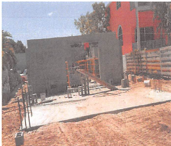
REAR / SIDE