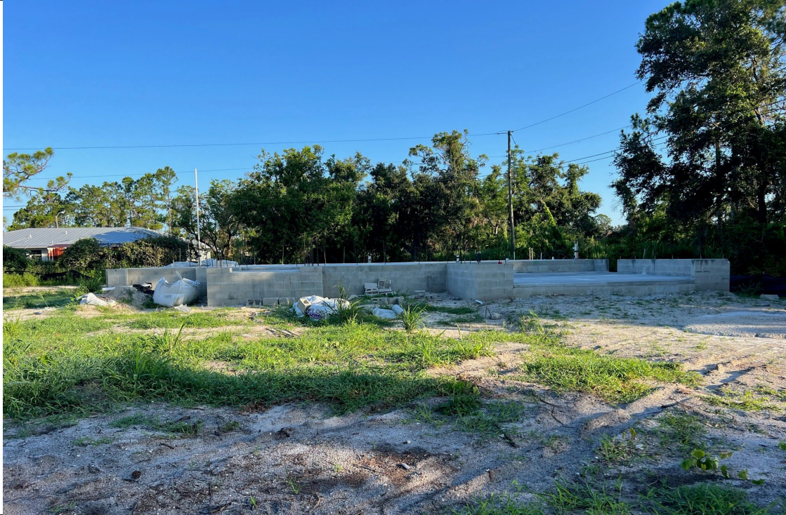
Photo 1 Caption Front View Date Taken 6/27/23

If using the Elevation Certificate to obtain NFIP flood insurance, affix at least 2 building photographs below according to the instructions for Item A6. Identify all photographs with date taken; "Front View" and "Rear View"; and, if required, "Right Side View" and "Left Side View." When applicable, photographs must show the foundation with representative examples of the flood openings or vents, as indicated in Section A8. If submitting more photographs than will fit on this page, use the Continuation Page.