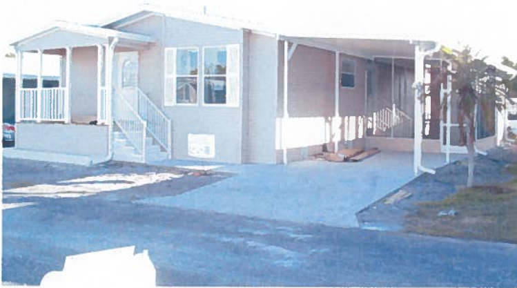
FIGURE 2 –REAR/ LEFT SIDE VIEW