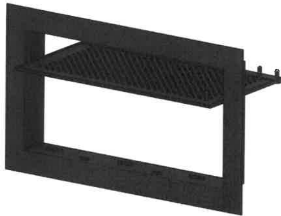
FIGURE 2—MODEL FFV-1608 FREEDOM FLOOD VENT®: SHOWN WITH FLOOD DOOR PIVOTED OPEN