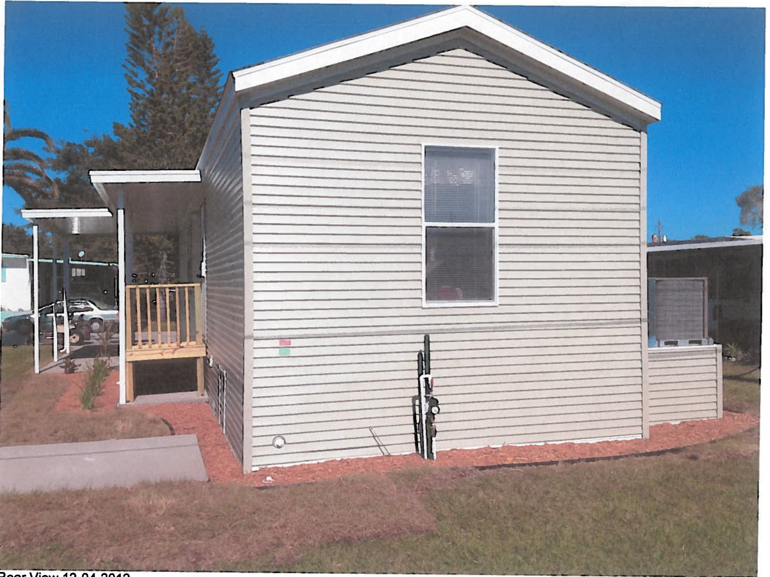
Rear View 12-04-2012

If submitting more photographs than will fit on the preceding page, affix the additional photographs below. Identify all photographs with: date taken; "Front View" and "Rear View"; and, if required, "Right Side View" and "Left Side View."