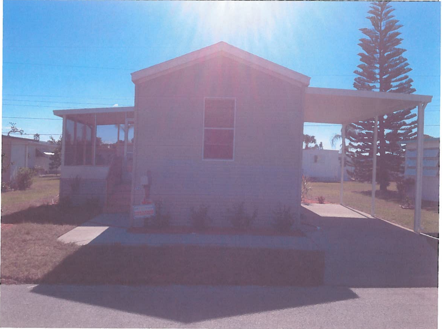
Front View 12-04-2012

If using the Elevation Certificate to obtain NFIP flood insurance, affix at least two building photographs below according to the instructions for Item A6. Identify all photographs with: date taken; "Front View" and "Rear View"; and, if required, "Right Side View" and "Left Side View." If submitting more photographs than will fit on this page, use the Continuation Page on the reverse.