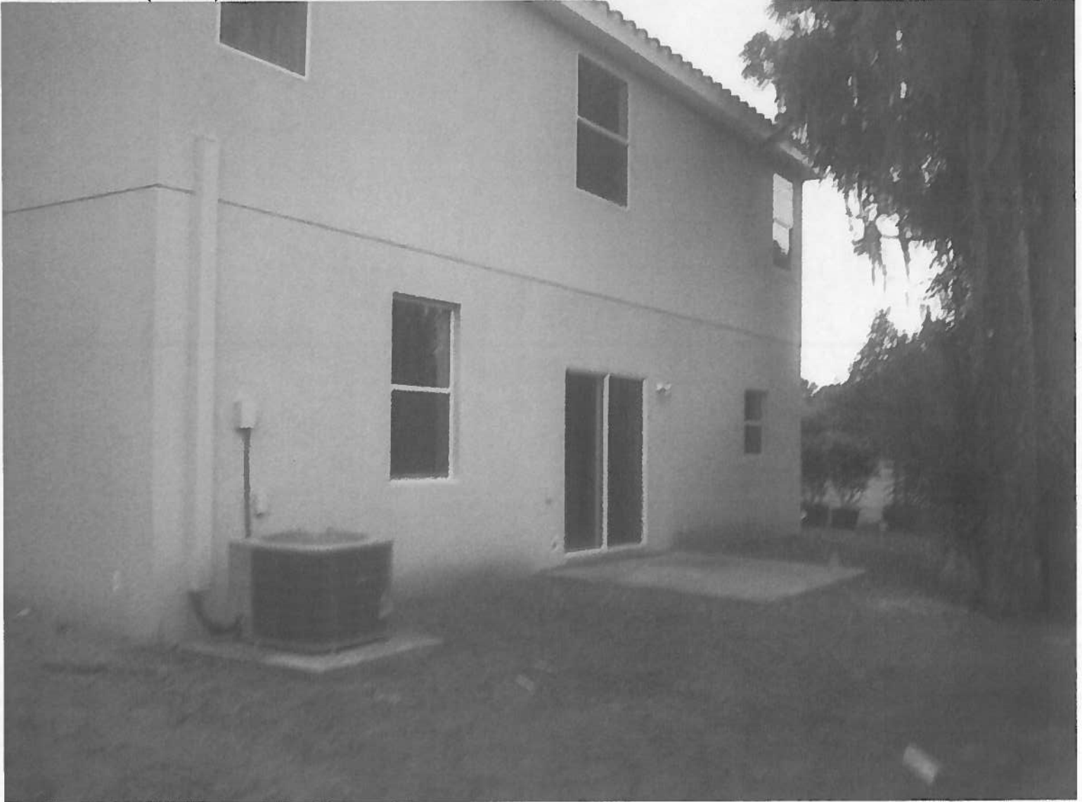
REAR PICTURE (6/21/10)

If submitting more photographs than will fit on the preceding page, affix the additional photographs below. Identify all photographs with: date taken; "Front View" and "Rear View"; and, if required, "Right Side View" and "Left Side View."