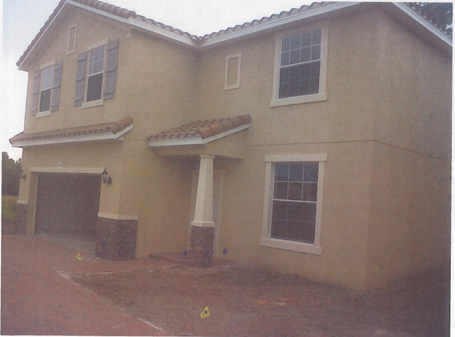
FRONT PICTURE (6/21/10)

If using the Elevation Certificate to obtain NFIP flood insurance, affix at least two building photographs below according to the instructions for Item A6. Identify all photographs with: date taken; "Front View" and "Rear View"; and, if required, "Right Side View" and "Left Side View." If submitting more photographs than will fit on this page, use the Continuation Page on the reverse.