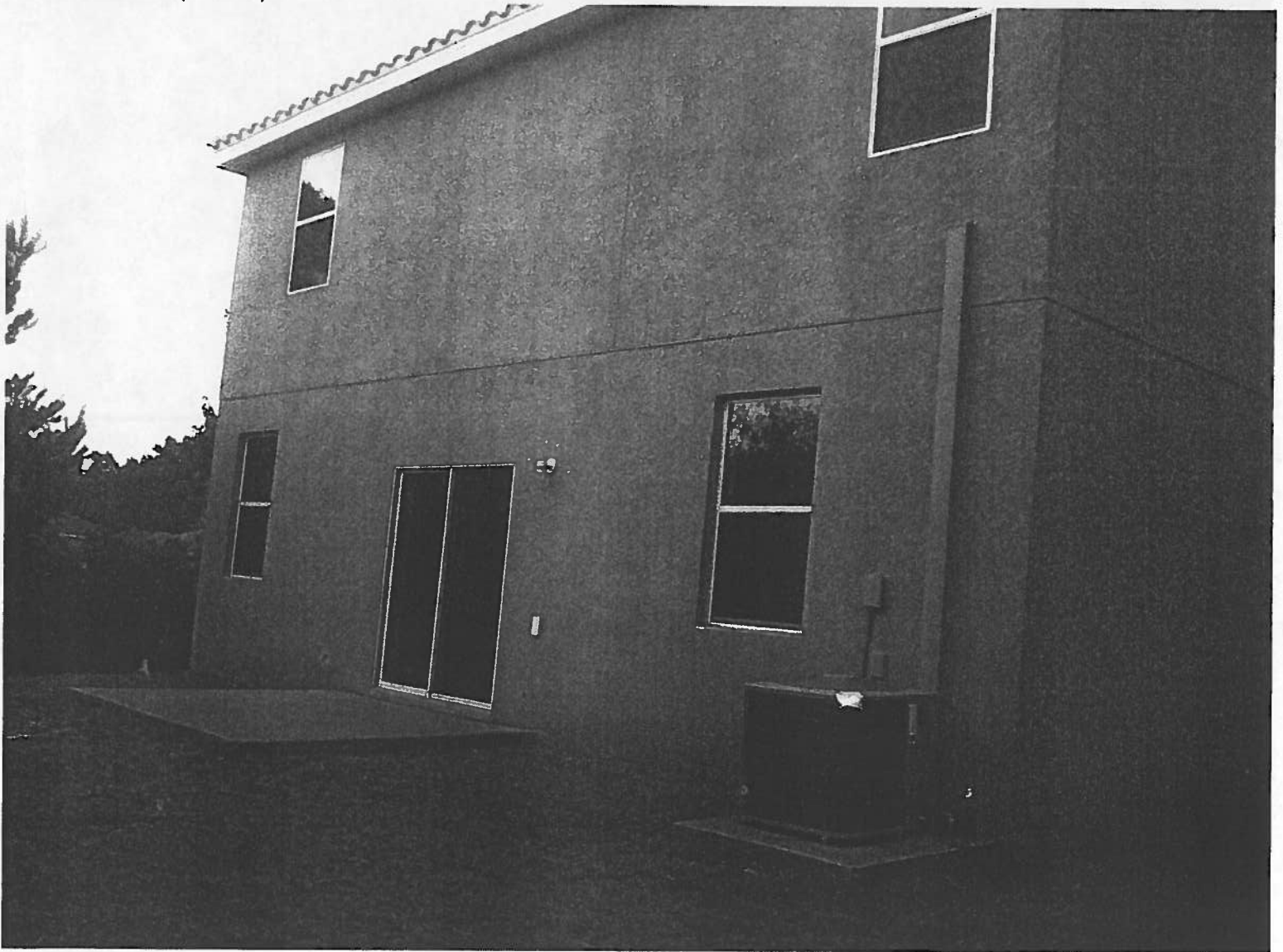
REAR PICTURE (6/21/10)