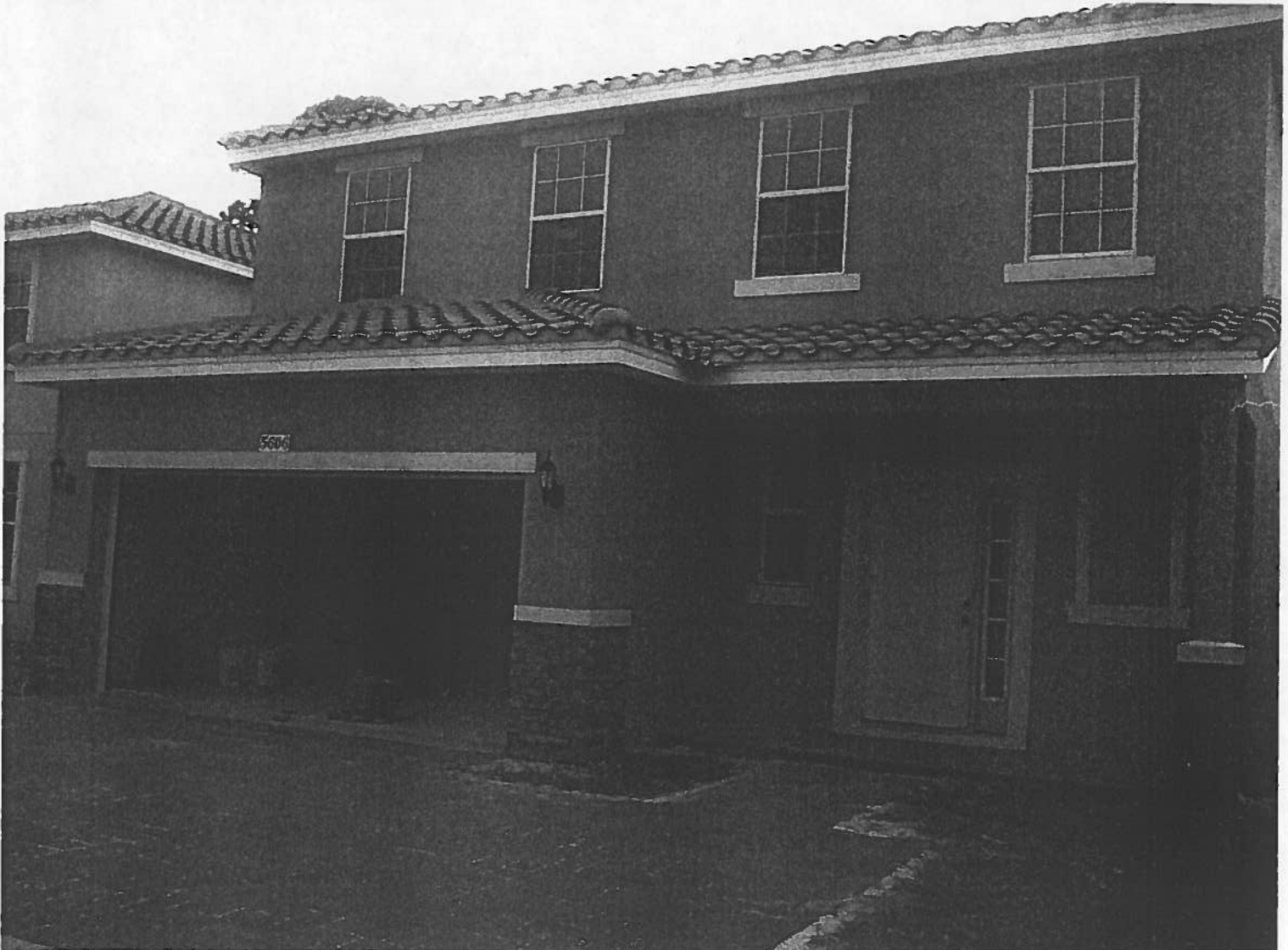
FRONT PICTURE (6/21/10)

If using the Elevation Certificate to obtain NFIP flood insurance, affix at least two building photographs below according to the instructions for Item A6. Identify all photographs with: date taken; "Front View" and "Rear View"; and, if required, "Right Side View" and "Left Side View." If submitting more photographs than will fit on this page, use the Continuation Page on the reverse.