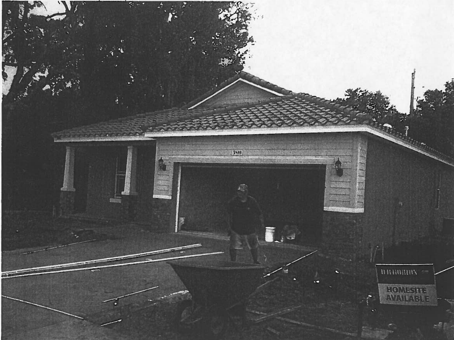
FOUNDATION PICTURE (6/21/10)

If using the Elevation Certificate to obtain NFIP flood insurance, affix at least two building photographs below according to the instructions for Item A6. Identify all photographs with: date taken; "Front View" and "Rear View"; and, if required, "Right Side View" and "Left Side View." If submitting more photographs than will fit on this page, use the Continuation Page on the reverse.