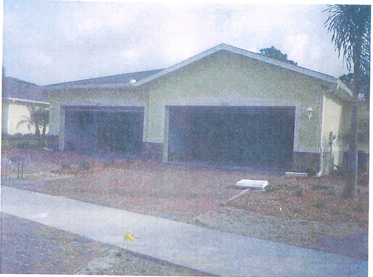
FRONT PICTURE (6/7/12)

If using the Elevation Certificate to obtain NFIP flood insurance, affix at least two building photographs below according to the instructions for Item A6. Identify all photographs with: date taken; "Front View" and "Rear View"; and, if required, "Right Side View" and "Left Side View." If submitting more photographs than will fit on this page, use the Continuation Page on the reverse.