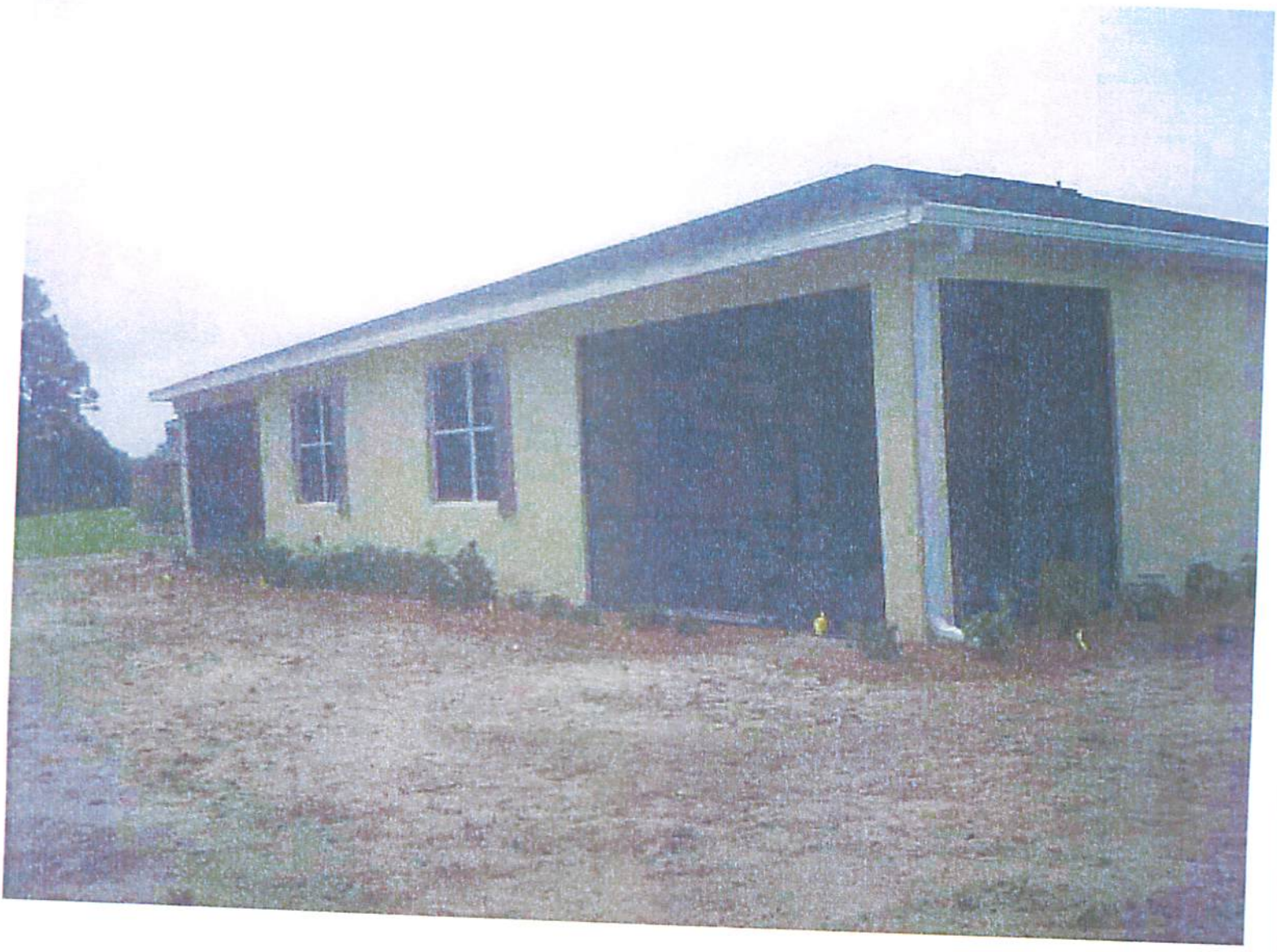
REAR PICTURE (6/7/12)