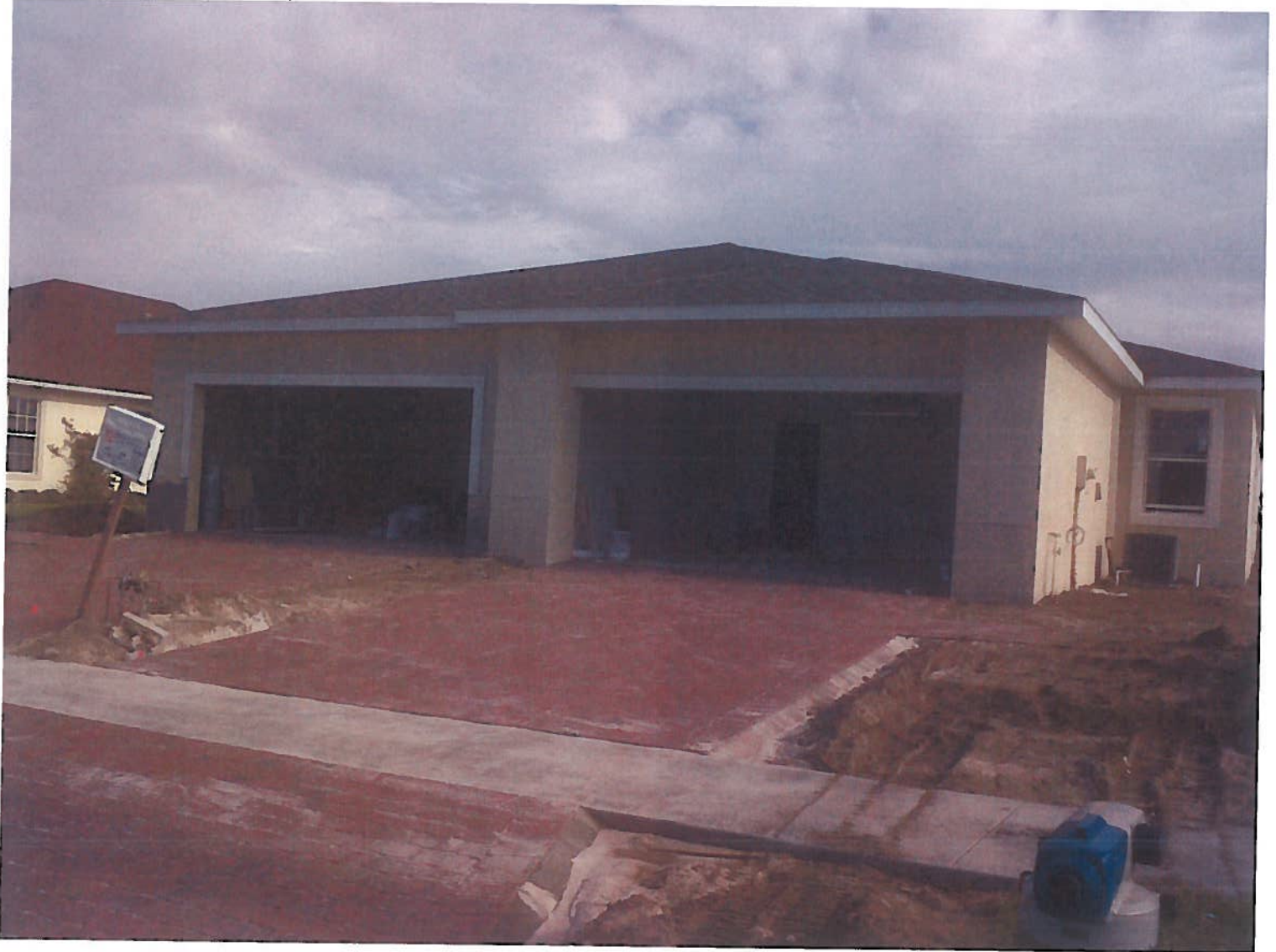
FRONT PICTURE (12/22/09)