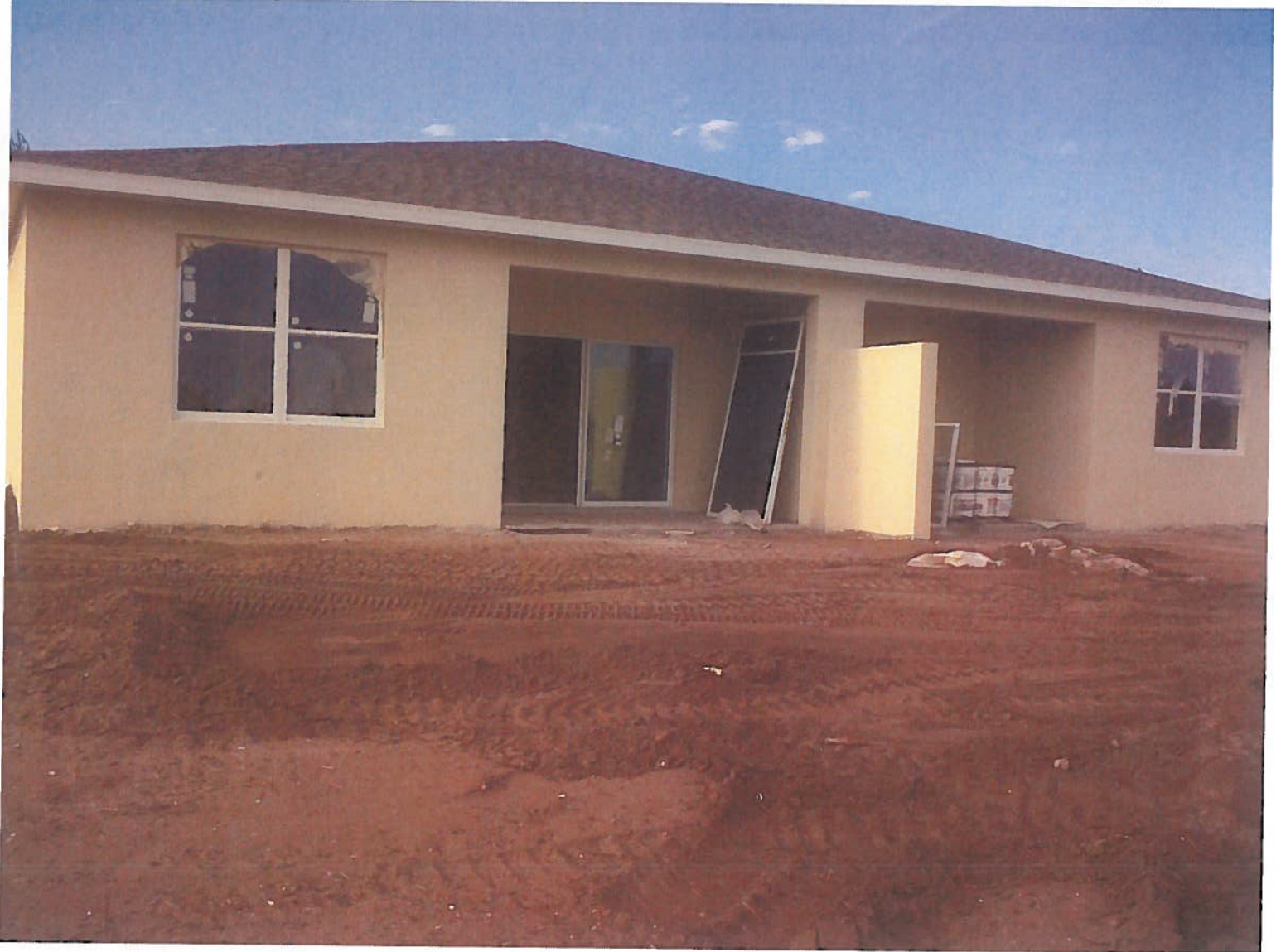
REAR PICTURE (12/22/09)