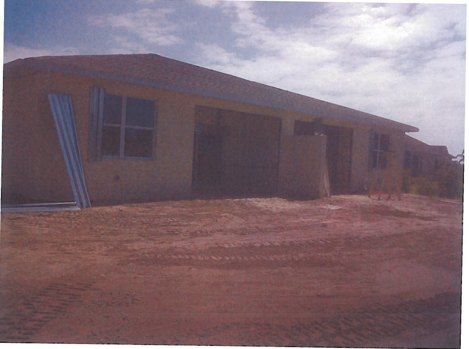
REAR PICTURE (3/22/10)