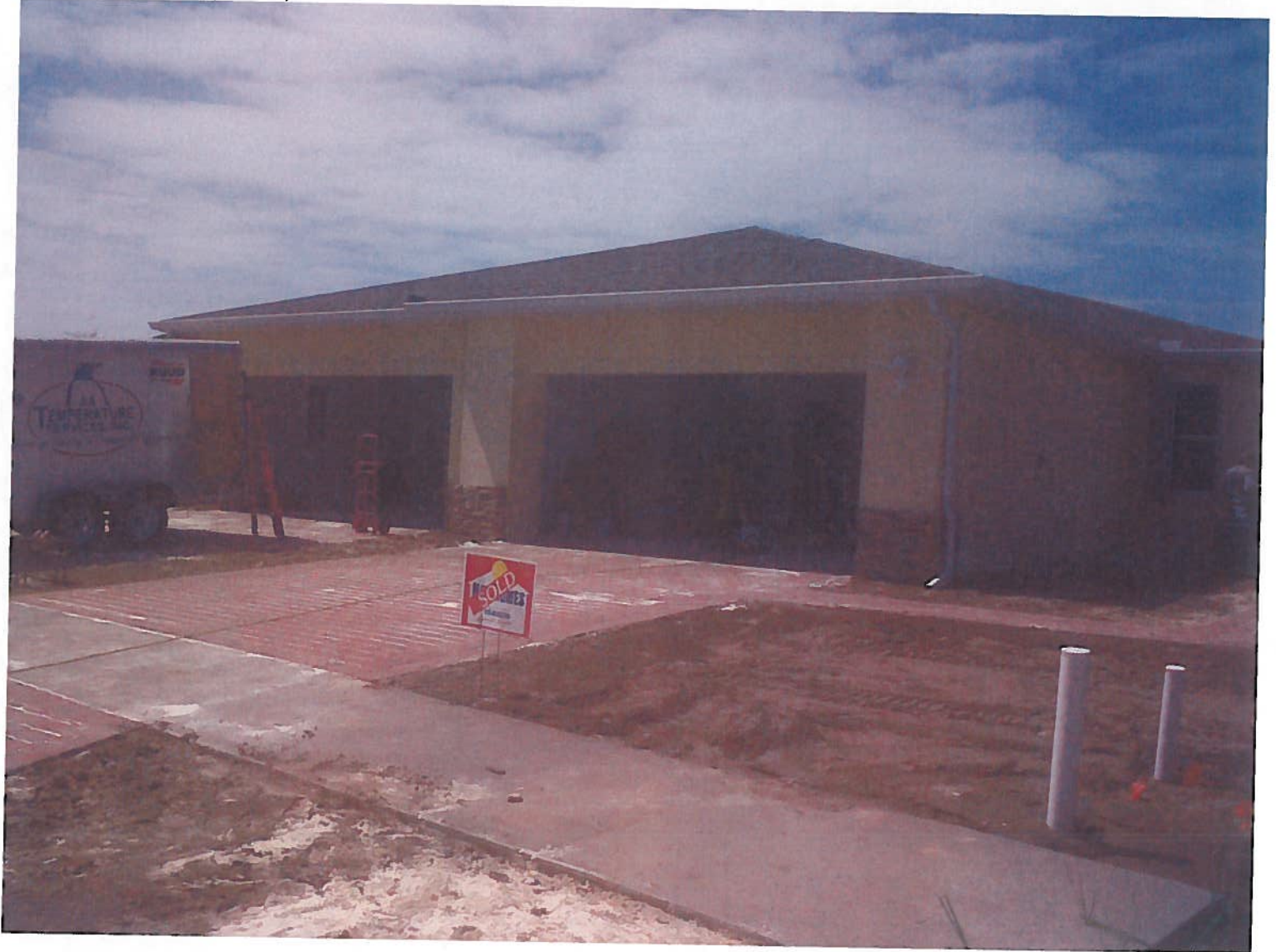
FRONT PICTURE (3/22/10)

If using the Elevation Certificate to obtain NFIP flood insurance, affix at least two building photographs below according to the instructions for Item A6. Identify all photographs with: date taken; "Front View" and "Rear View"; and, if required, "Right Side View" and "Left Side View." If submitting more photographs than will fit on this page, use the Continuation Page on the reverse.