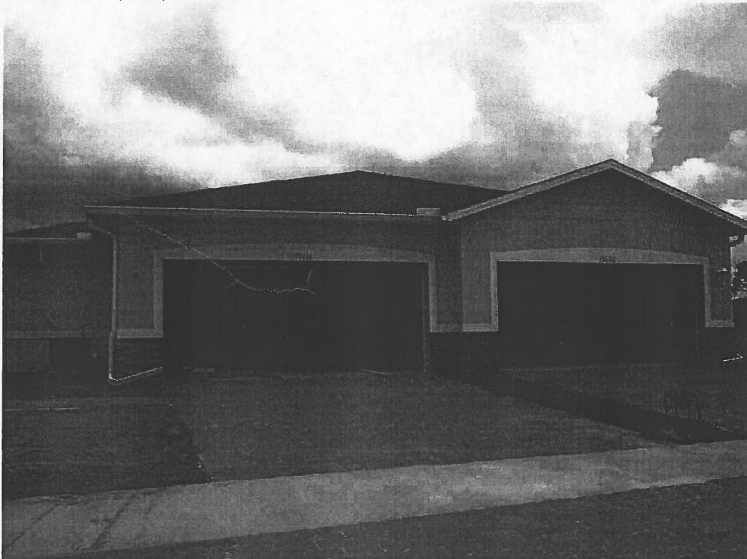
FRONT PICTURE (8/19/10)

If using the Elevation Certificate to obtain NFIP flood insurance, affix at least two building photographs below according to the instructions for Item A6. Identify all photographs with: date taken; "Front View" and "Rear View"; and, if required, "Right Side View" and "Left Side View." If submitting more photographs than will fit on this page, use the Continuation Page on the reverse.