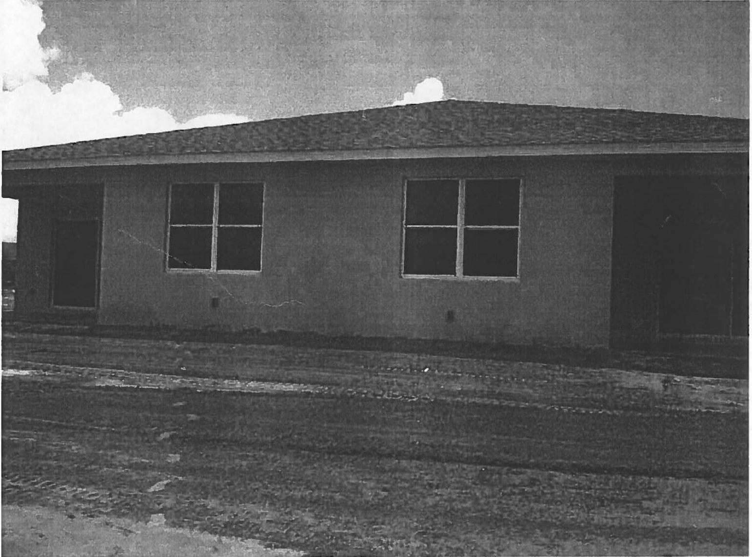
REAR PICTURE (8/19/10)