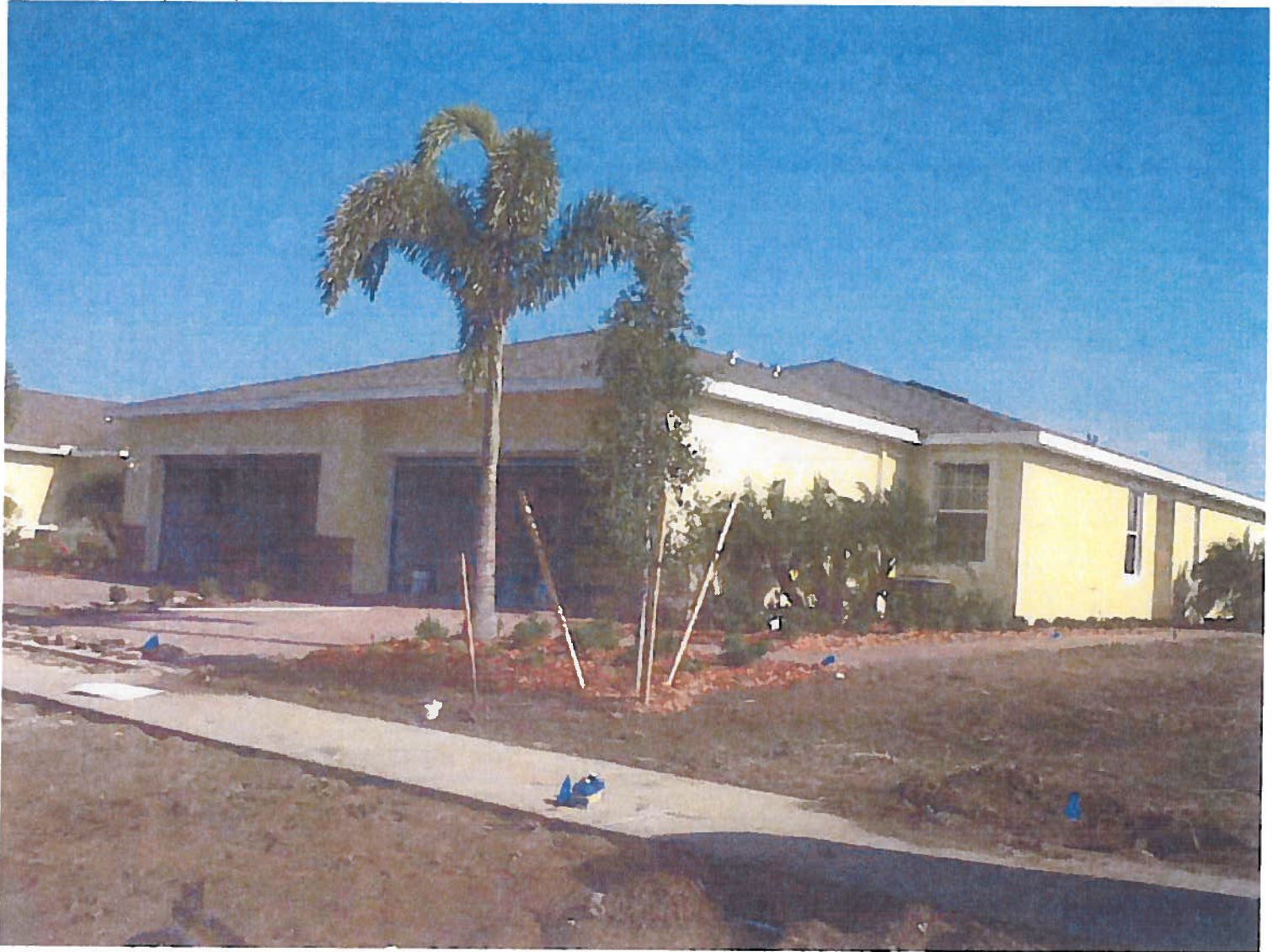
FRONT VIEW (6/10/11)

If using the Elevation Certificate to obtain NFIP flood insurance, affix at least two building photographs below according to the instructions for Item A6. Identify all photographs with: date taken; "Front View" and "Rear View"; and, if required, "Right Side View" and "Left Side View." If submitting more photographs than will fit on this page, use the Continuation Page on the reverse.