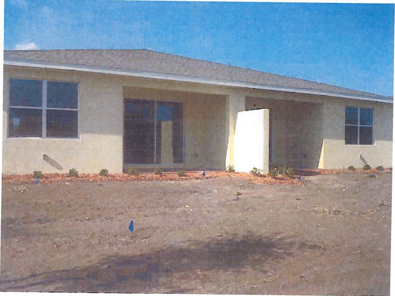
REAR PICTURE (6/10/11)

If submitting more photographs than will fit on the preceding page, affix the additional photographs below. Identify all photographs with: date taken; "Front View" and "Rear View"; and, if required, "Right Side View" and "Left Side View."