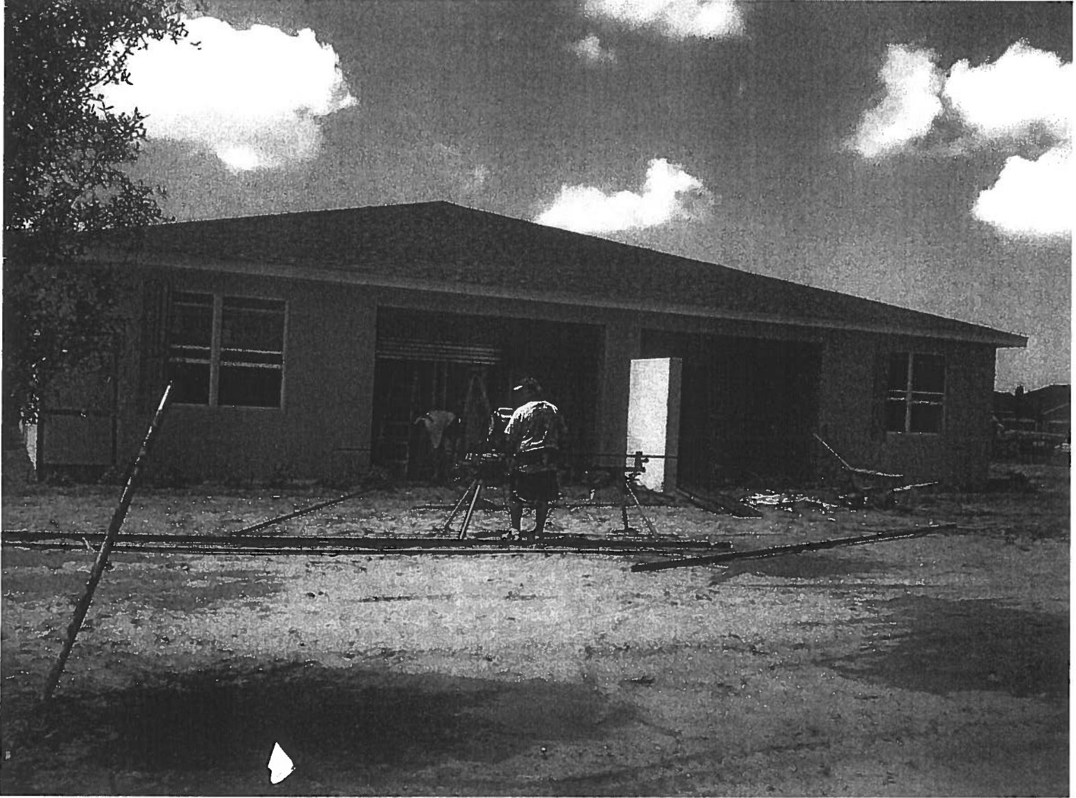
REAR PICTURE (6/23/10)