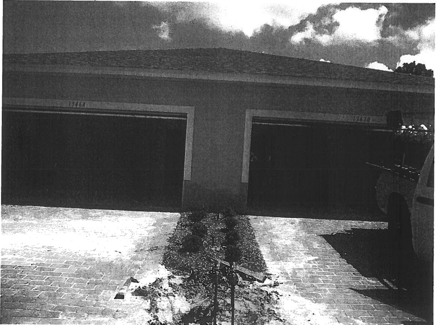
FRONT PICTURE (6/23/10)

If using the Elevation Certificate to obtain NFIP flood insurance, affix at least two building photographs below according to the instructions for Item A6. Identify all photographs with: date taken; "Front View" and "Rear View"; and, if required, "Right Side View" and "Left Side View." If submitting more photographs than will fit on this page, use the Continuation Page on the reverse.