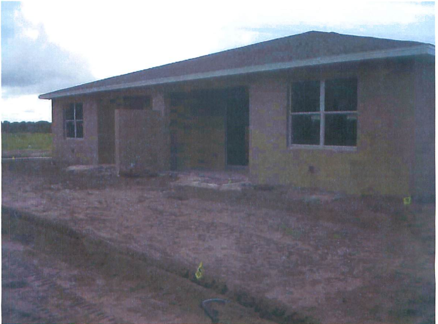
REAR PICTURE (8/1/11)

If submitting more photographs than will fit on the preceding page, affix the additional photographs below. Identify all photographs with: date taken; "Front View" and "Rear View"; and, if required, "Right Side View" and "Left Side View."