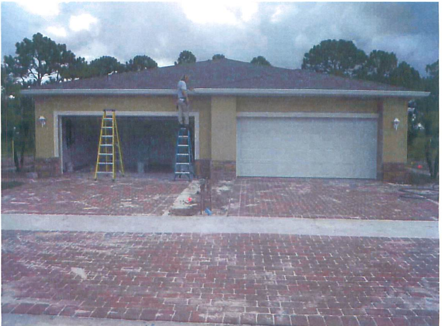
FRONT PICTURE (8/1/11)