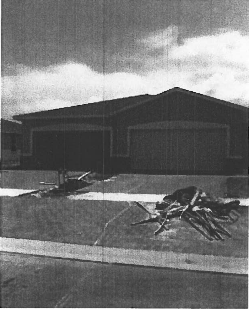
FRONT PICTURE (7/16/10)

If using the Elevation Certificate to obtain NFIP flood insurance, affix at least two building photographs below according to the instructions for Item A6. Identify all photographs with: date taken; "Front View" and "Rear View"; and, if required, "Right Side View" and "Left Side View." If submitting more photographs than will fit on this page, use the Continuation Page on the reverse.