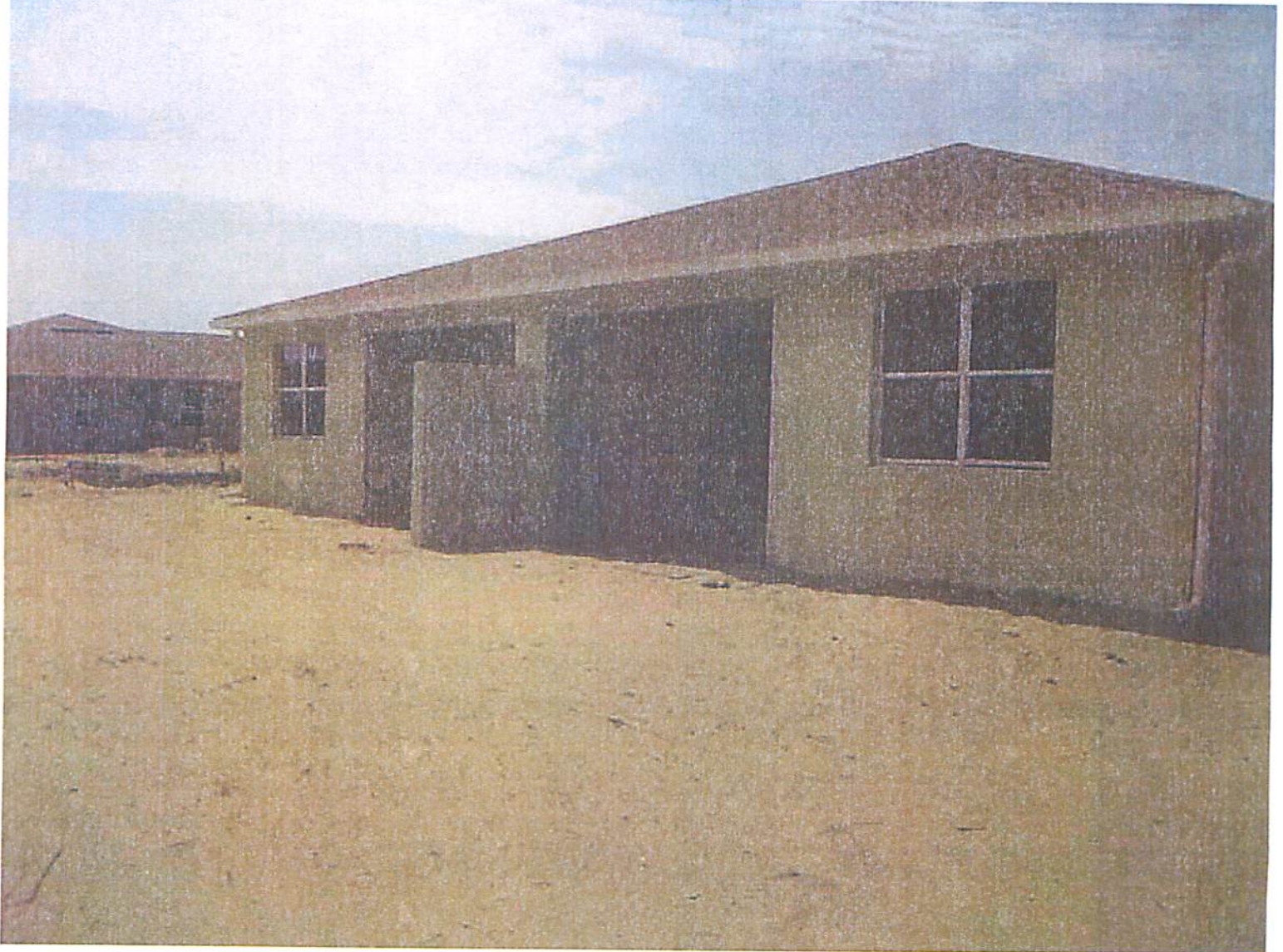
REAR PICTURE (4/13/12)