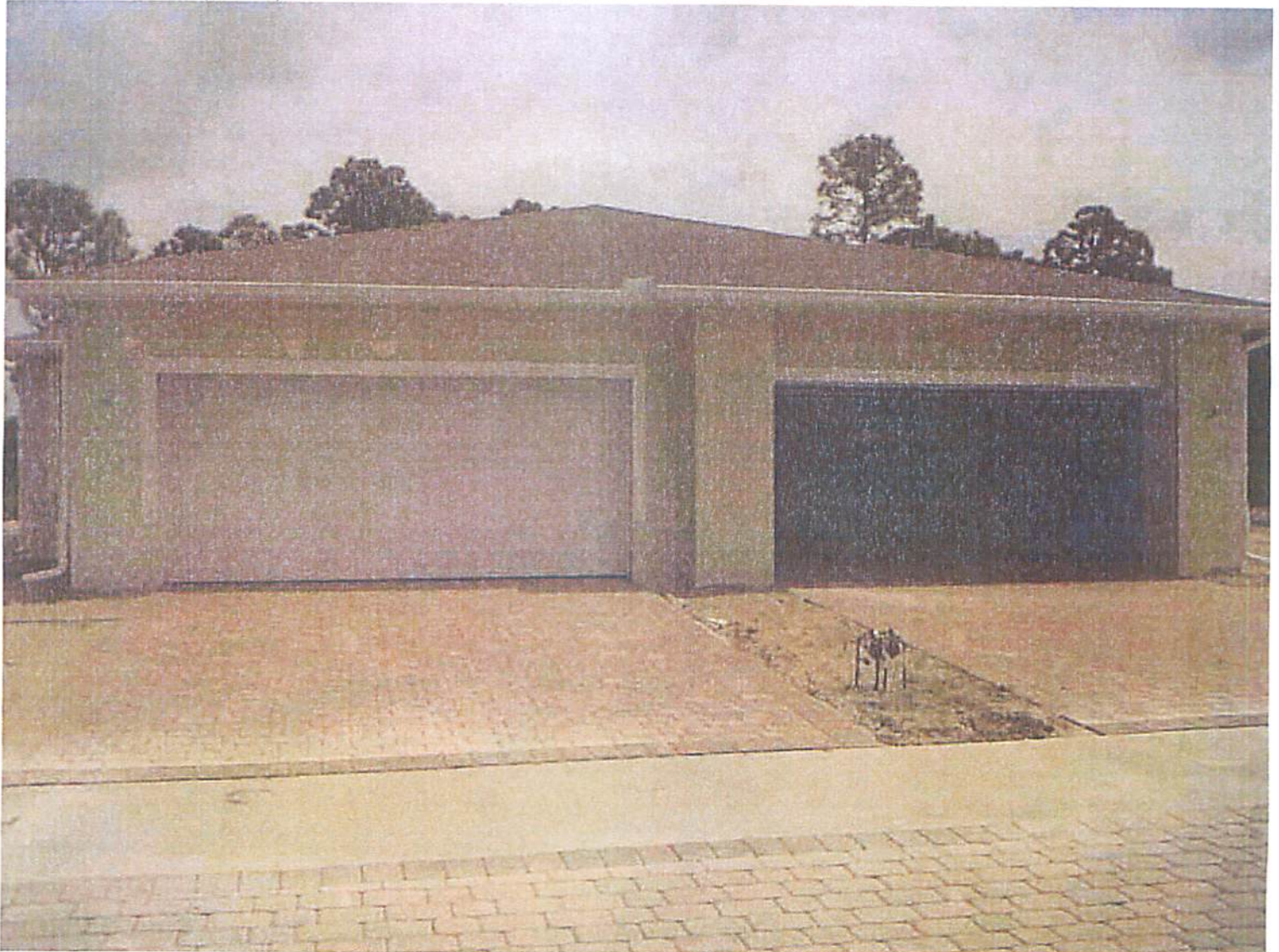
FRONT PICTURE (4/13/12)

If using the Elevation Certificate to obtain NFIP flood insurance, affix at least two building photographs below according to the instructions for Item A6. Identify all photographs with: date taken; "Front View" and "Rear View"; and, if required, "Right Side View" and "Left Side View." If submitting more photographs than will fit on this page, use the Continuation Page on the reverse.