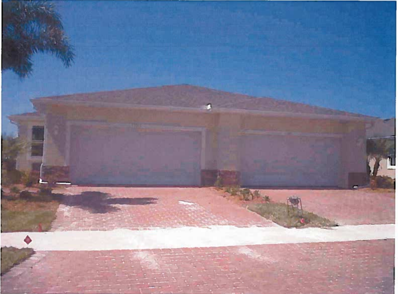
FRONT PICTURE (9/3/10)