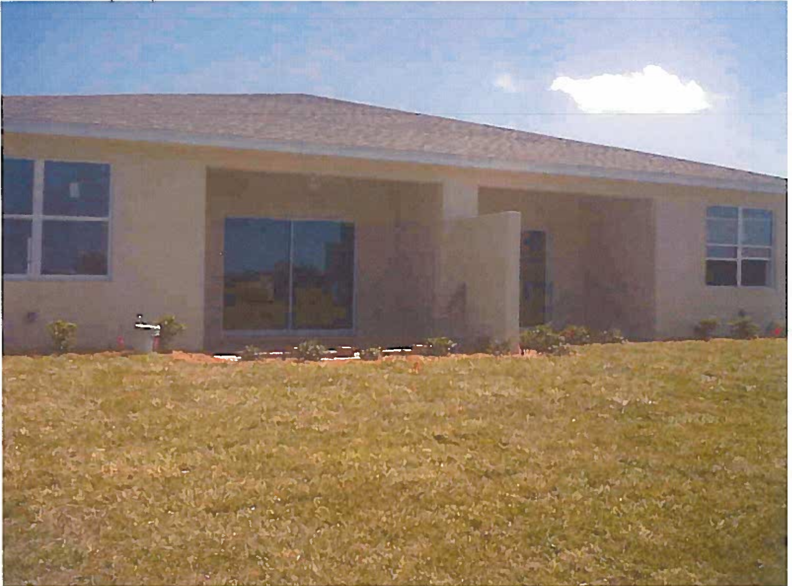
REAR PICTURE (9/3/10)

If submitting more photographs than will fit on the preceding page, affix the additional photographs below. Identify all photographs with: date taken, "Front View" and "Rear View"; and, if required, "Right Side View" and "Left Side View."