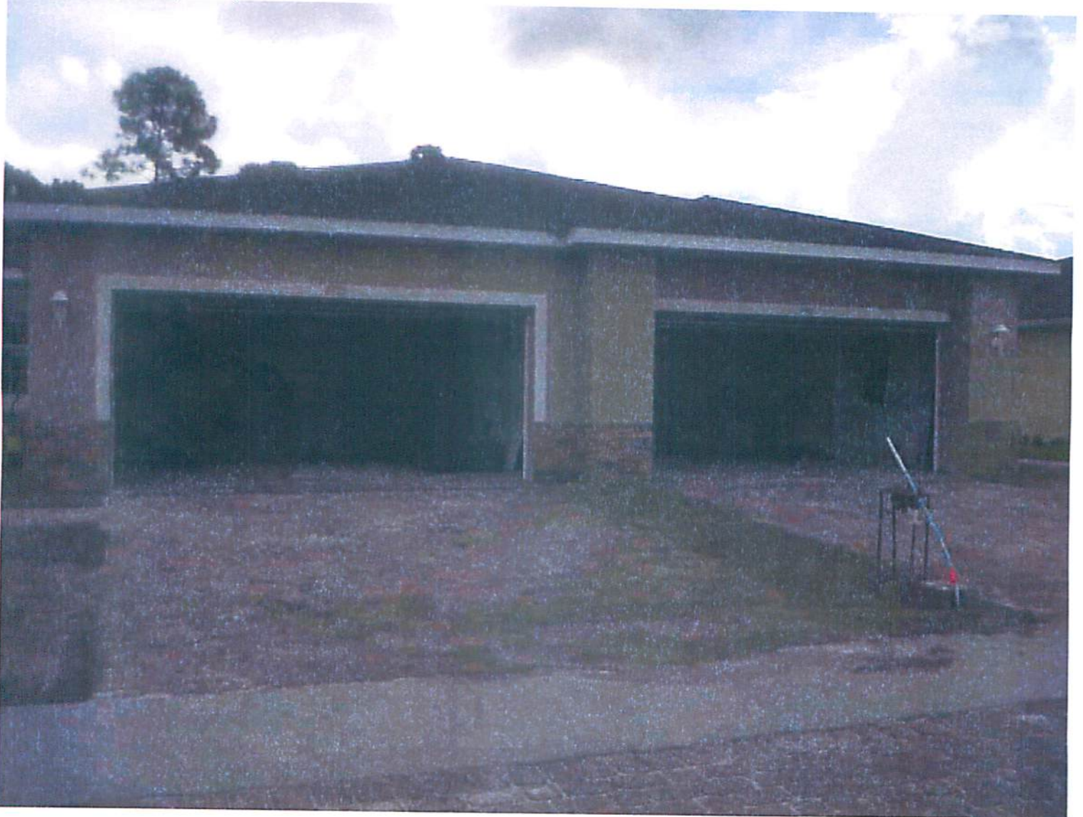
FRONT PICTURE (8/16/12)

If using the Elevation Certificate to obtain NFIP flood insurance, affix at least two building photographs below according to the instructions for Item A6. Identify all photographs with: date taken; "Front View" and "Rear View"; and, if required, "Right Side View" and "Left Side View." If submitting more photographs than will fit on this page, use the Continuation Page on the reverse.