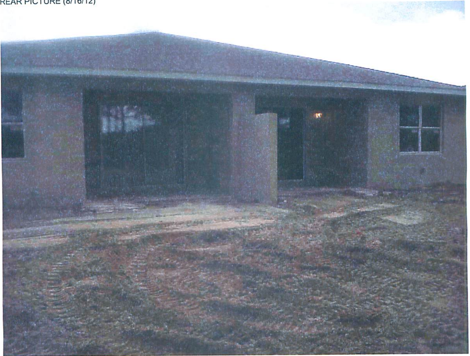
REAR PICTURE (8/16/12)