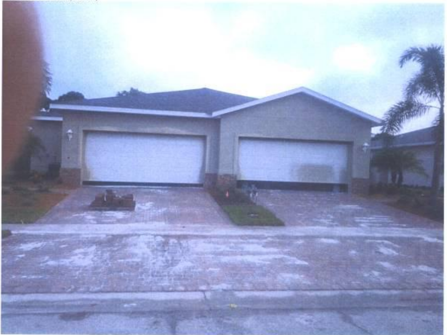
FRONT PICTURE (10/5/12)

If using the Elevation Certificate to obtain NFIP flood insurance, affix at least two building photographs below according to the instructions for Item A6. Identify all photographs with: date taken; "Front View" and "Rear View"; and, if required, "Right Side View" and "Left Side View." If submitting more photographs than will fit on this page, use the Continuation Page on the reverse.