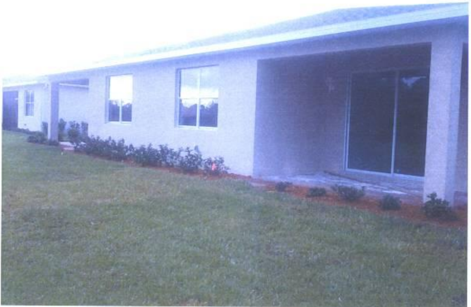
REAR PICTURE (10/5/12)