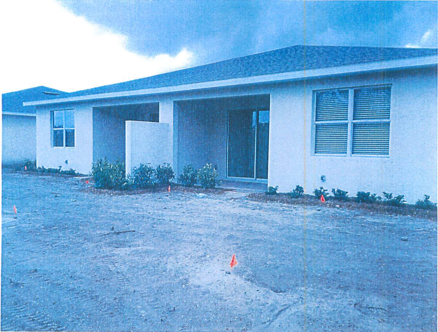
REAR PICTURE (8/29/12)

If submitting more photographs than will fit on the preceding page, affix the additional photographs below. Identify all photographs with: date taken; "Front View" and "Rear View"; and, if required, "Right Side View" and "Left Side View."