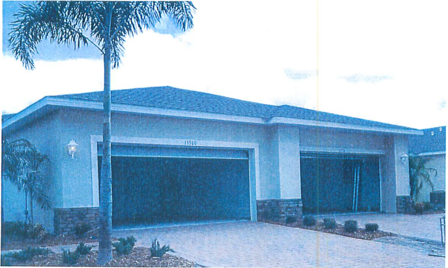
FRONT PICTURE (8/29/12)

If using the Elevation Certificate to obtain NFIP flood insurance, affix at least two building photographs below according to the instructions for Item A6. Identify all photographs with: date taken; "Front View" and "Rear View"; and, if required, "Right Side View" and "Left Side View." If submitting more photographs than will fit on this page, use the Continuation Page on the reverse.