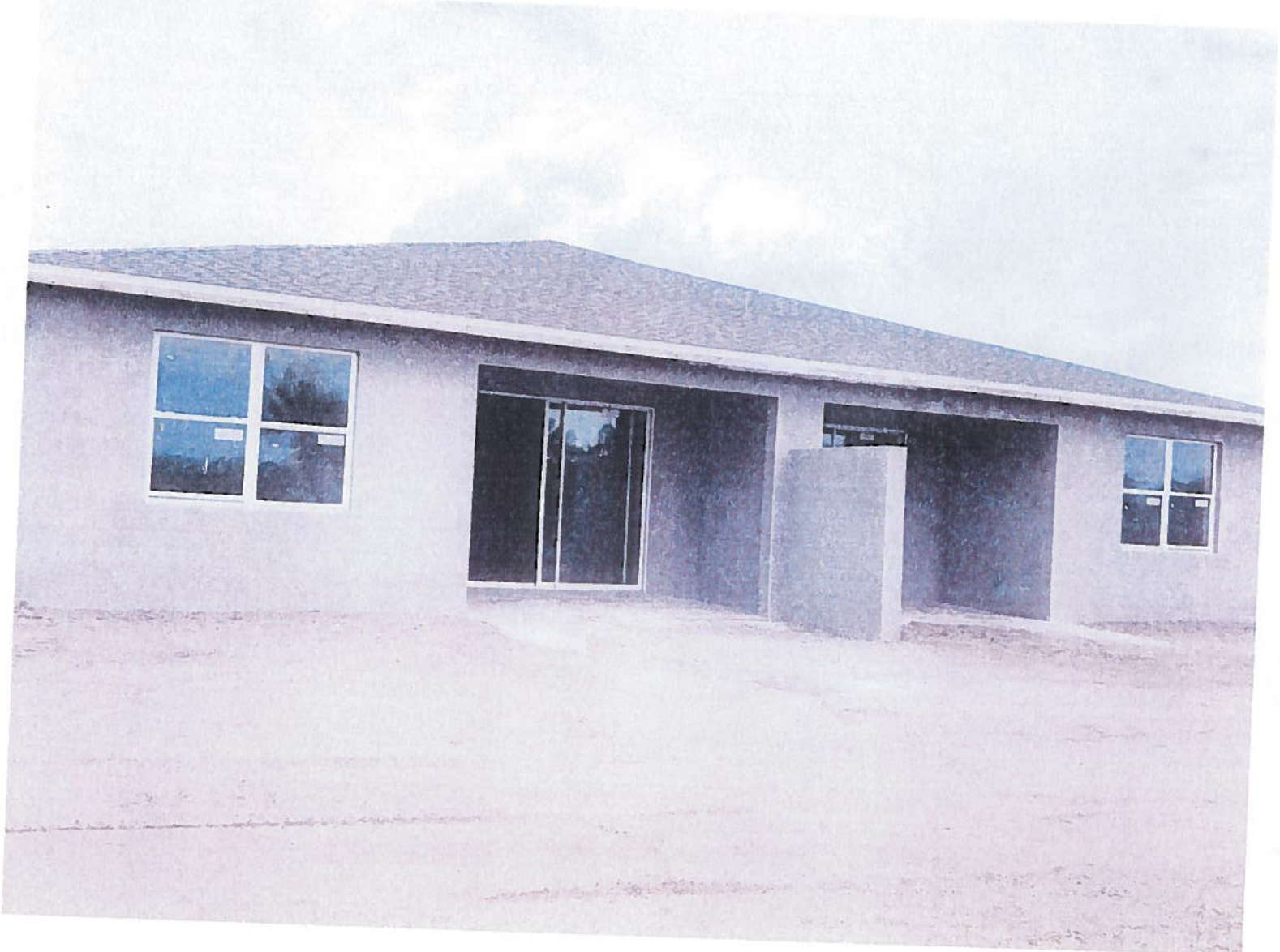
REAR PICTURE (11/6/12)