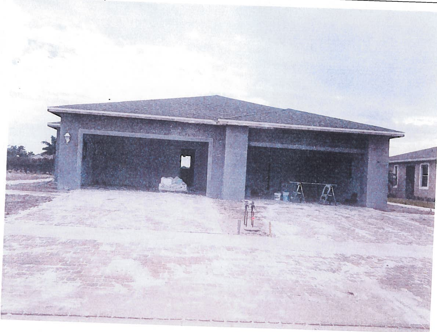
FRONT PICTURE (11/6/12)

If using the Elevation Certificate to obtain NFIP flood insurance, affix at least two building photographs below according to the instructions for Item A6. Identify all photographs with: date taken; "Front View" and "Rear View"; and, if required, "Right Side View" and "Left Side View." If submitting more photographs than will fit on this page, use the Continuation Page on the reverse.