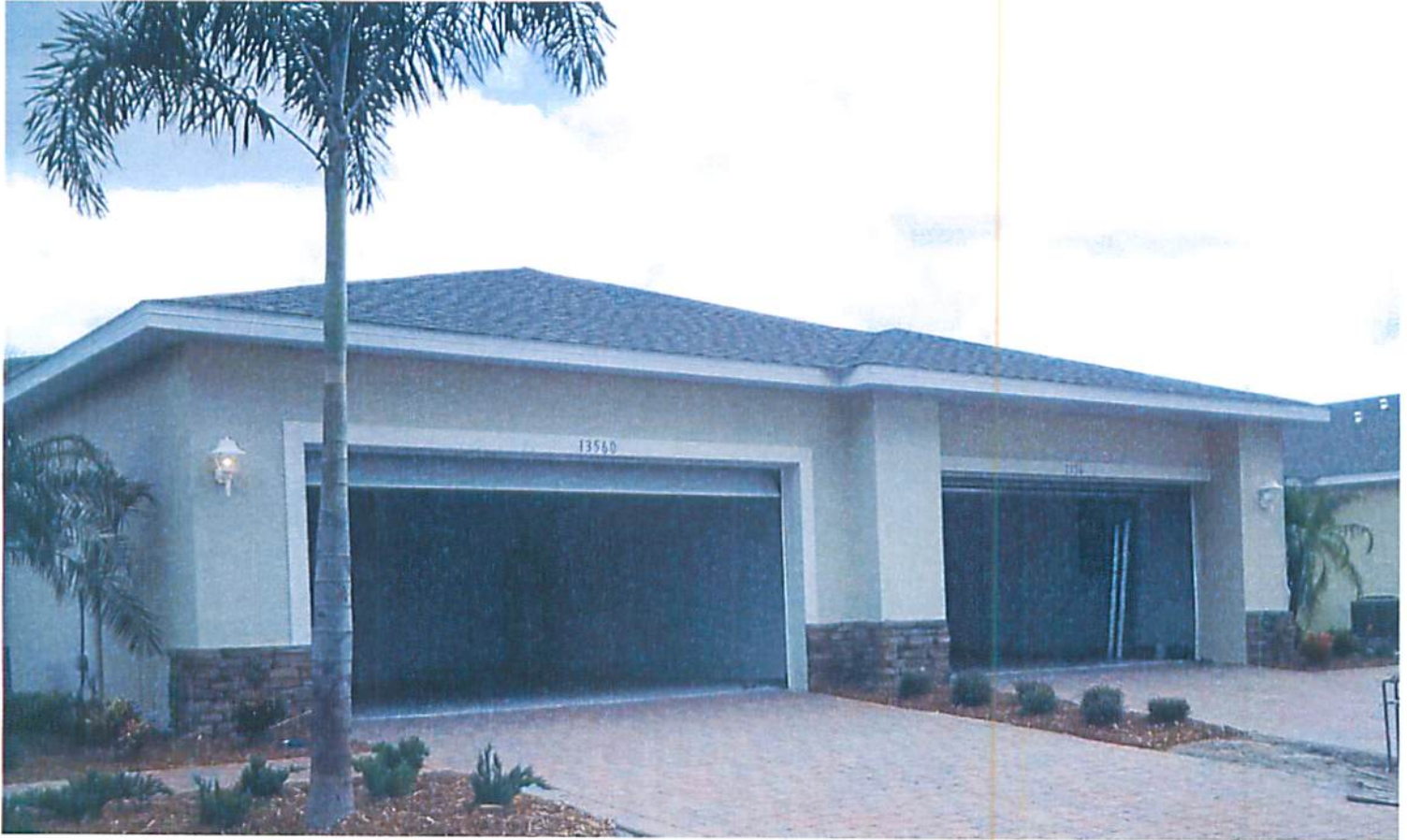
FRONT PICTURE (8/29/12)

If using the Elevation Certificate to obtain NFIP flood insurance, affix at least two building photographs below according to the instructions for Item A6. Identify all photographs with: date taken; "Front View" and "Rear View"; and, if required, "Right Side View" and "Left Side View." If submitting more photographs than will fit on this page, use the Continuation Page on the reverse.