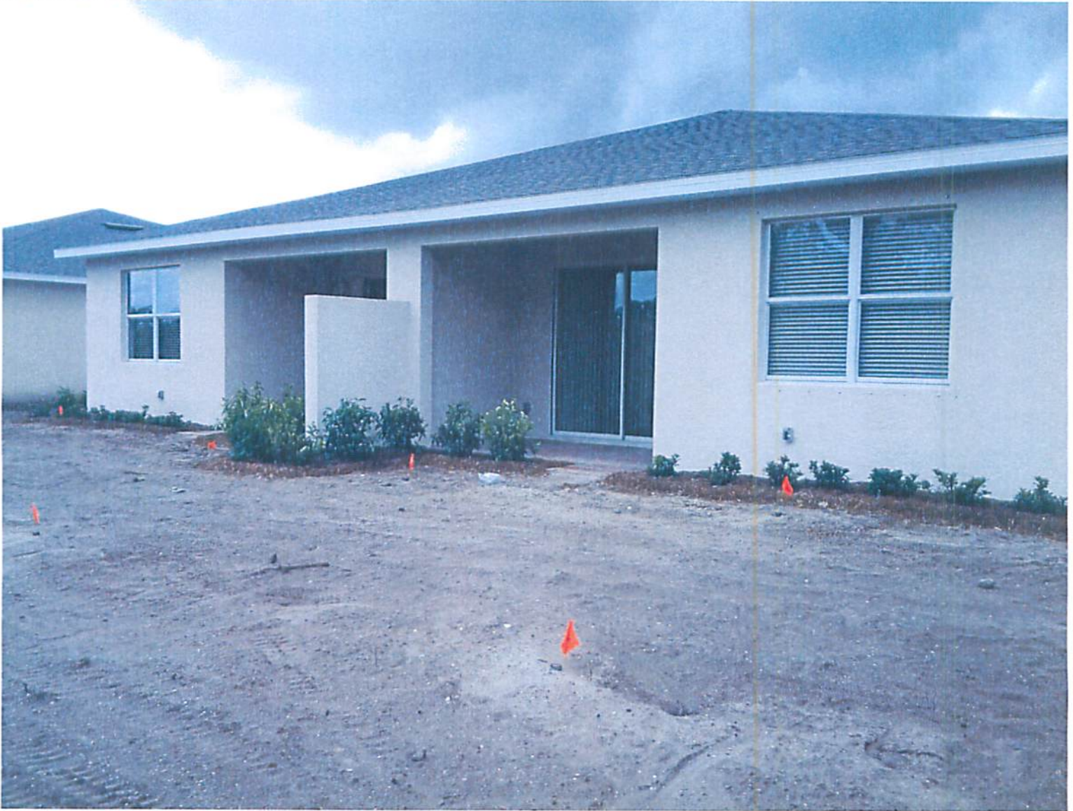
REAR PICTURE (8/29/12)

If submitting more photographs than will fit on the preceding page, affix the additional photographs below. Identify all photographs with: date taken; "Front View" and "Rear View"; and, if required, "Right Side View" and "Left Side View."