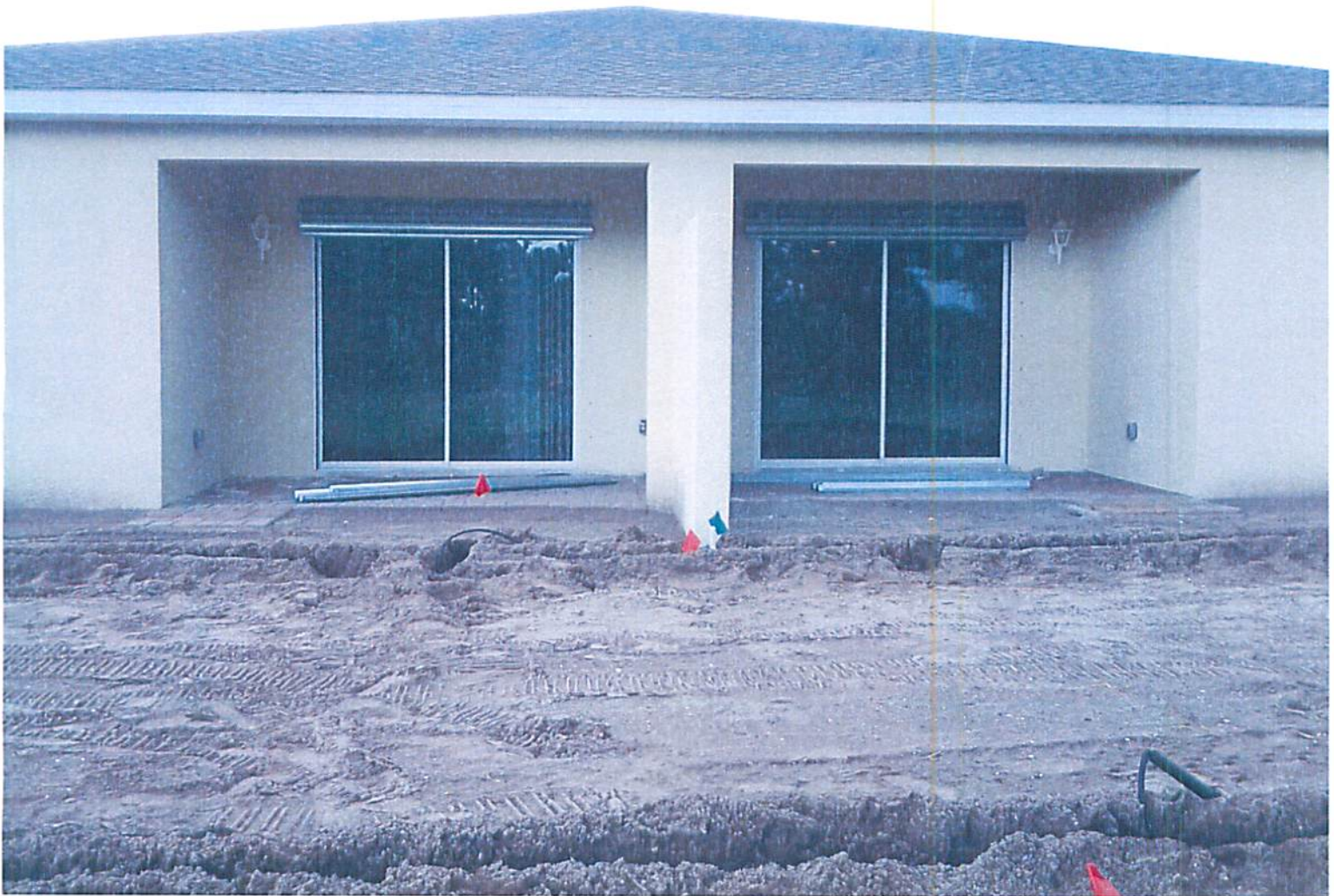
REAR PICTURE (8/29/12)

If submitting more photographs than will fit on the preceding page, affix the additional photographs below. Identify all photographs with: date taken; "Front View" and "Rear View"; and, if required, "Right Side View" and "Left Side View."