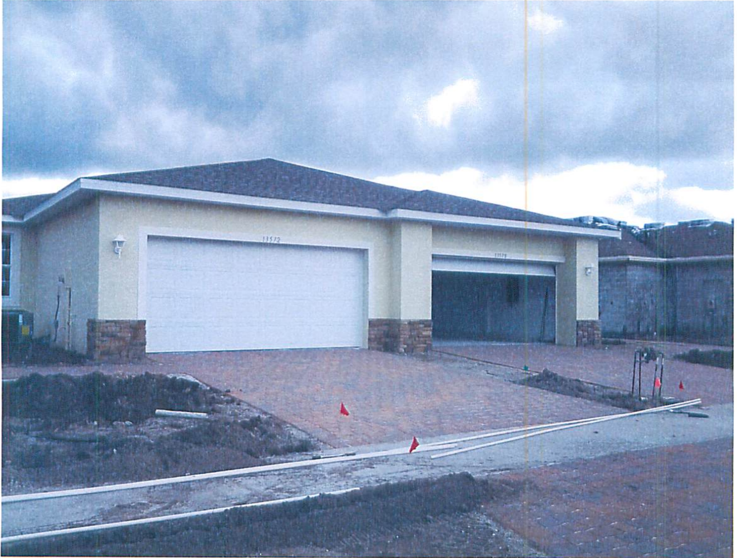
FRONT PICTURE (8/29/12)

If using the Elevation Certificate to obtain NFIP flood insurance, affix at least two building photographs below according to the instructions for Item A6. Identify all photographs with: date taken; "Front View" and "Rear View"; and, if required, "Right Side View" and "Left Side View." If submitting more photographs than will fit on this page, use the Continuation Page on the reverse.