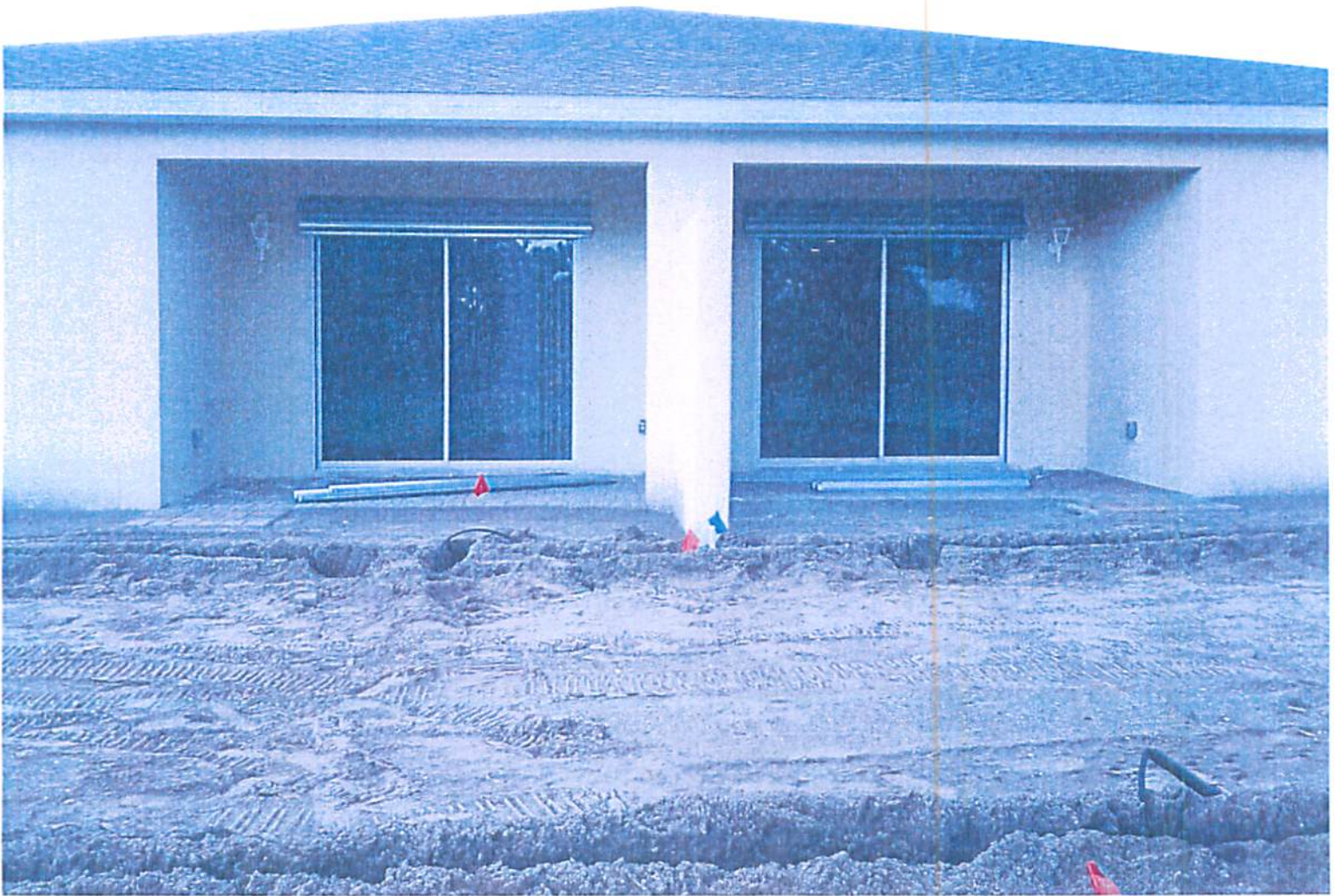
REAR PICTURE (8/29/12)

If submitting more photographs than will fit on the preceding page, affix the additional photographs below. Identify all photographs with: date taken; "Front View" and "Rear View"; and, if required, "Right Side View" and "Left Side View."