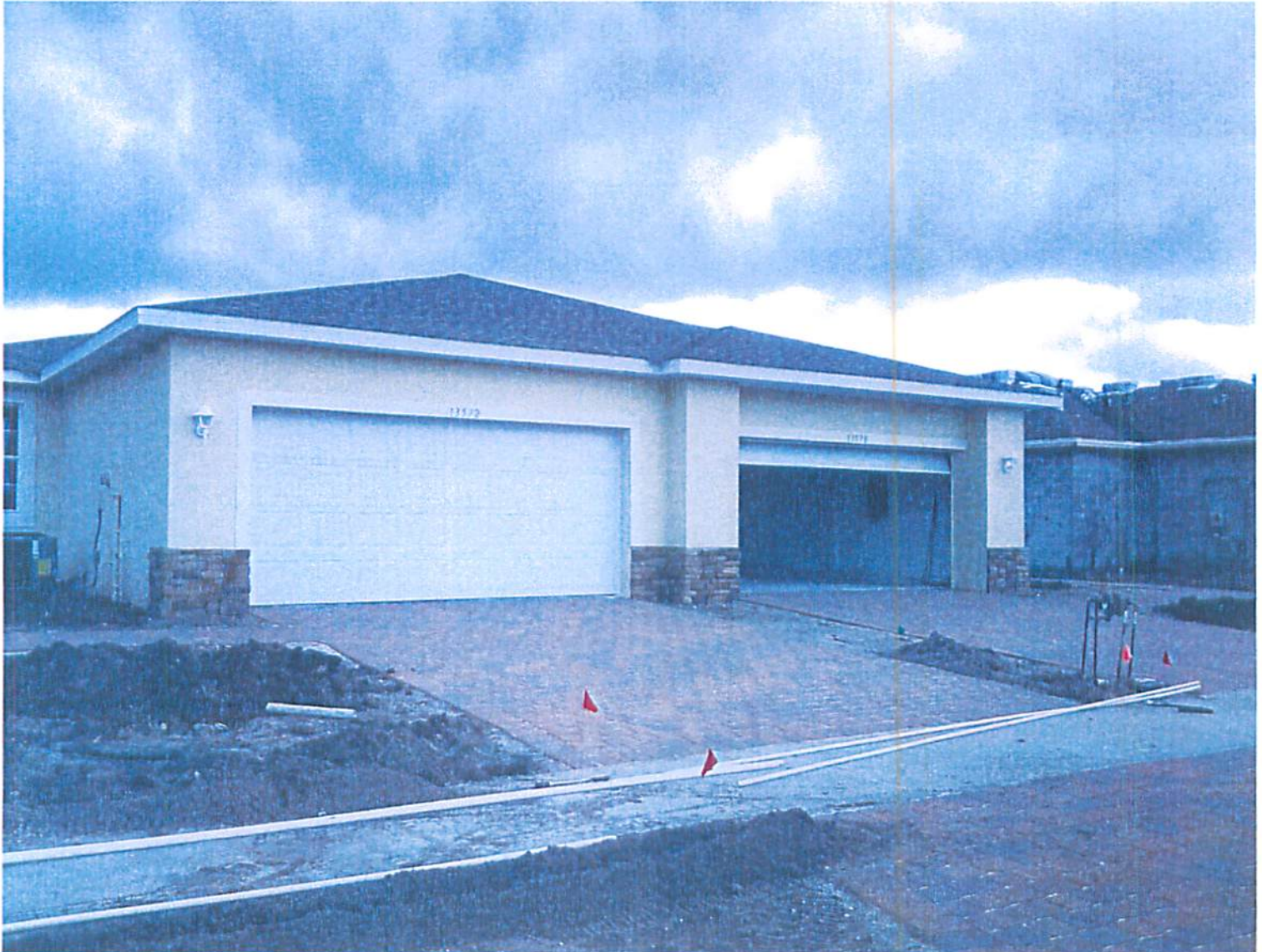
FRONT PICTURE (8/29/12)