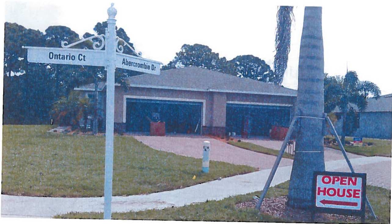
Front Picture 4/15/2013

If using the Elevation Certificate to obtain NFIP flood insurance, affix at least 2 building photographs below according to the instructions for Item A6. Identify all photographs with date taken; "Front View" and "Rear View"; and, if required, "Right Side View" and "Left Side View." When applicable, photographs must show the foundation with representative examples of the flood openings or vents, as indicated in Section A8. If submitting more photographs than will fit on this page, use the Continuation Page.