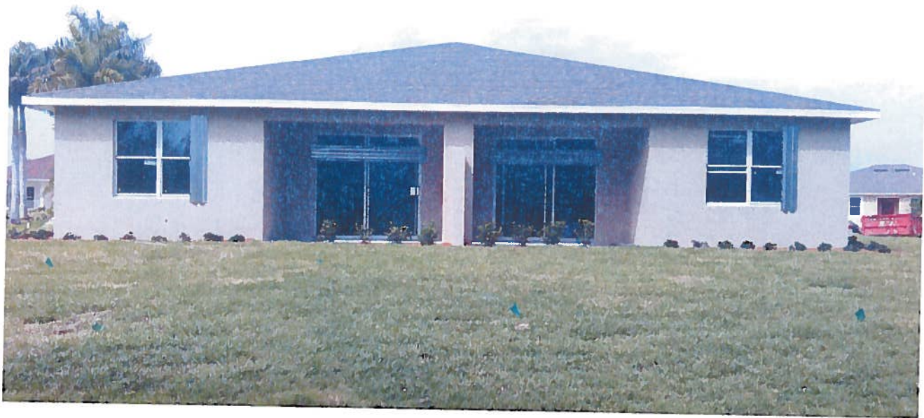
Rear Picture 4/15/2013

If submitting more photographs than will fit on the preceding page, affix the additional photographs below. Identify all photographs with: date taken; "Front View" and "Rear View"; and, if required, "Right Side View" and "Left Side View." When applicable, photographs must show the foundation with representative examples of the flood openings or vents, as indicated in Section A8.