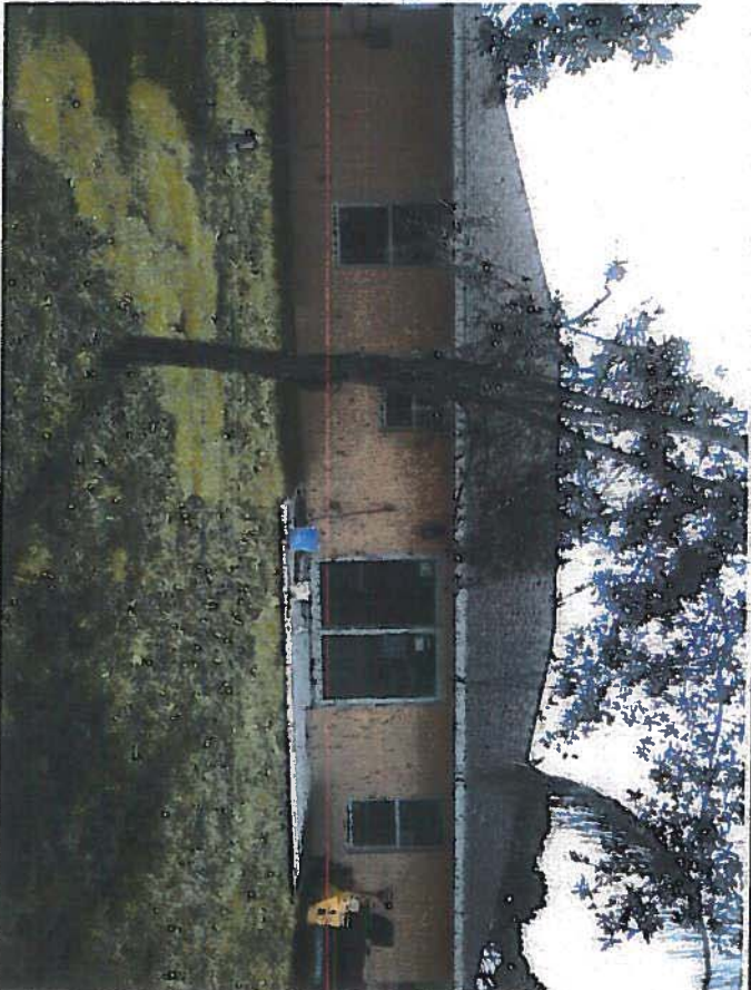
REAR VIEW 08/02/2019