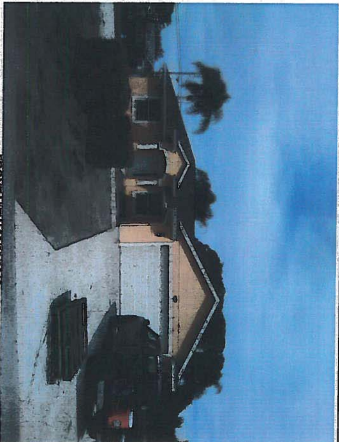
FRONT VIEW 08/02/2019

If using the Elevation Certificate to obtain NFIP flood insurance, affix at least 2 building photographs below according to the instructions for Item A6. Identify all photographs with date taken; "Front View" and "Rear View"; and, if required, "Right Side View" and "Left Side View." When applicable, photographs must show the foundation with representative examples of the flood openings or vents, as indicated in Section A8. If submitting more photographs than will fit on this page, use the Continuation Page.