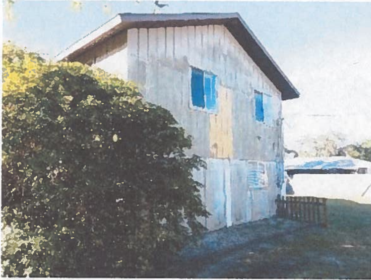
Left Side 10/30/14