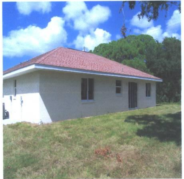
REAR VIEW 10-9-2007