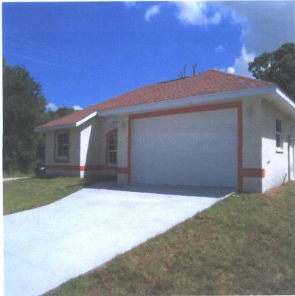
FRONT VIEW 10-9-2007

If using the Elevation Certificate to obtain NFIP flood insurance, affix at least two building photographs below according to the instructions for Item A6. Identify all photographs with: date taken; "Front View" and "Rear View"; and, if required, "Right Side View" and "Left Side View." If submitting more photographs than will fit on this page, use the Continuation Page, following.