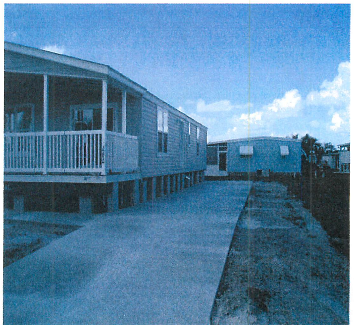
Right Side View Job # 14-1028