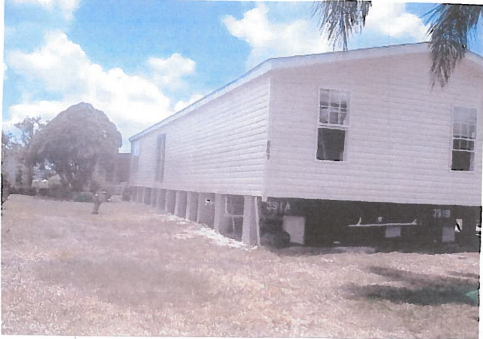
EAST SIDE VIEW

If submitting more photographs than will fit on the preceding page, affix the additional photographs below. Identify all photographs with: date taken; "Front View" and "Rear View"; and, if required, "Right Side View" and "Left Side View." When applicable, photographs must show the foundation with representative examples of the flood openings or vents, as indicated in Section AB.