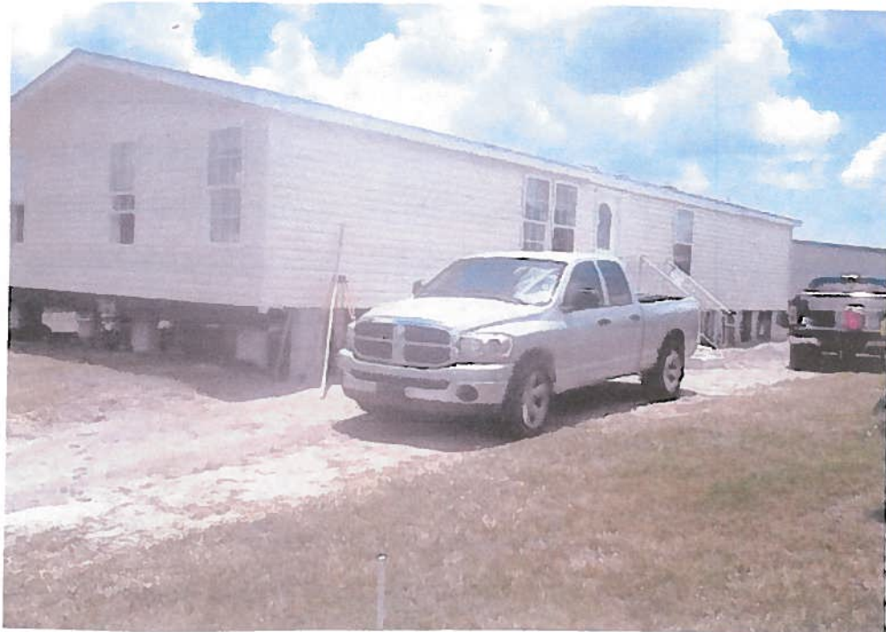
WEST SIDE VIEW