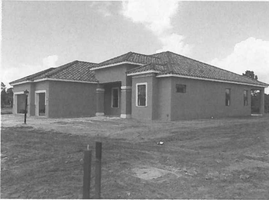
Rear and Left side View