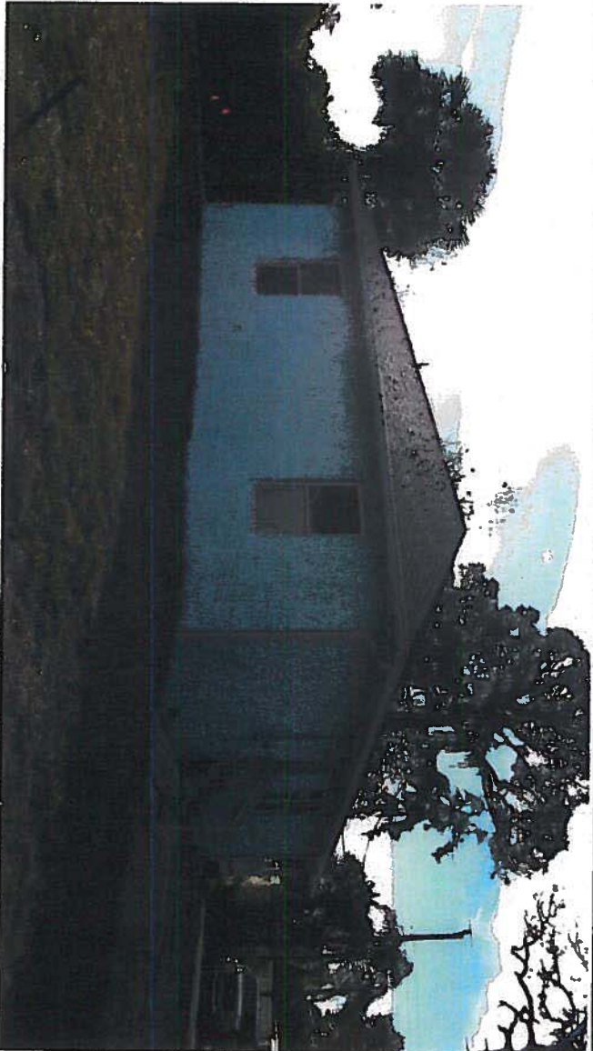
REAR VIEW 01/30/18