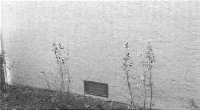
FLOOD VENT (Photo Date: 02/06/15)