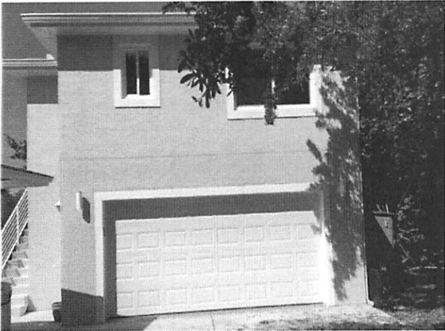
LEFT SIDE VIEW (Photo Date: 02/06/15)

If using the Elevation Certificate to obtain NFIP flood insurance, affix at least 2 building photographs below according to the instructions for Item A6. Identify all photographs with date taken; "Front View" and "Rear View"; and, if required, "Right Side View" and "Left Side View." When applicable, photographs must show the foundation with representative examples of the flood openings or vents, as indicated in Section A8. If submitting more photographs than will fit on this page, use the Continuation Page.