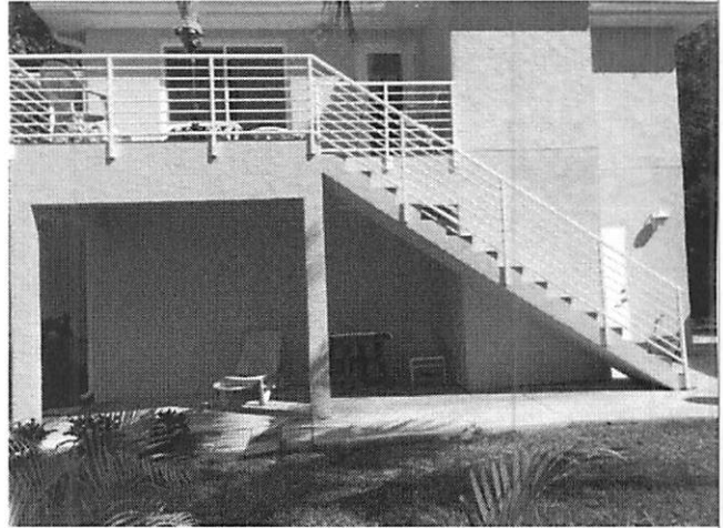
REAR VIEW (Photo Date: 02/06/15)