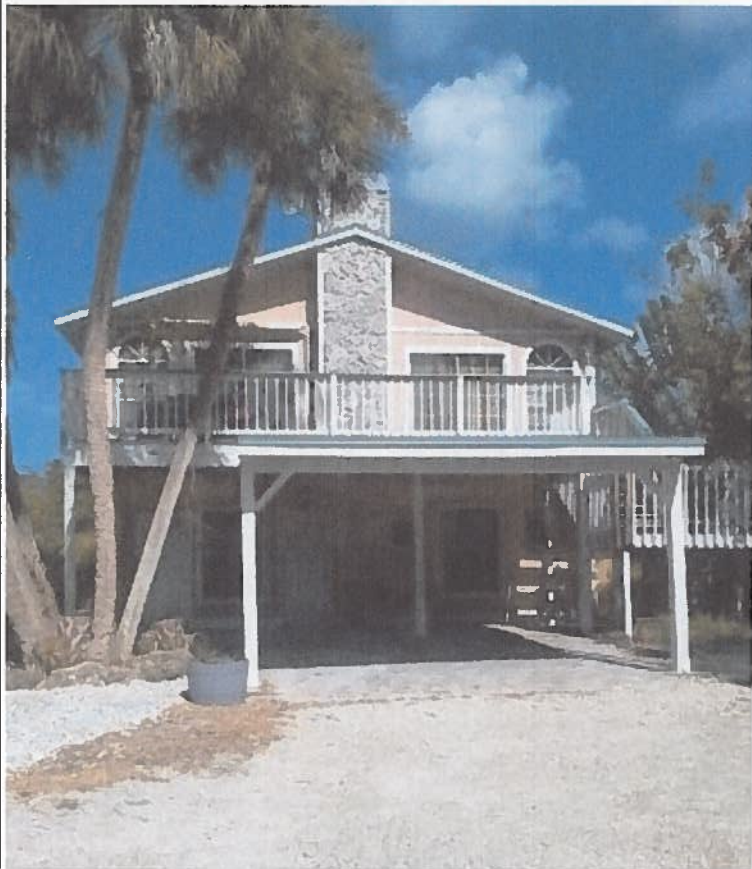
11/06/14 REAR VIEW