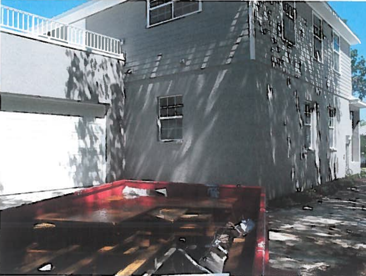
LEFT SIDE VIEW 3/17/15