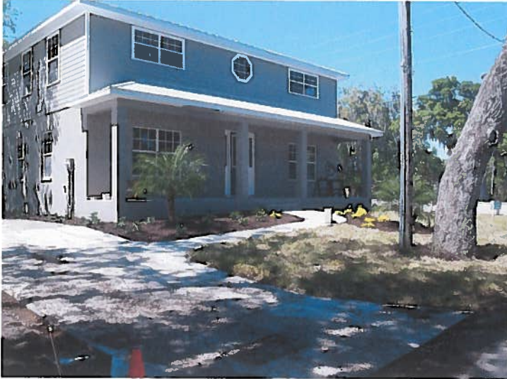
FRONT VIEW 3/17/15