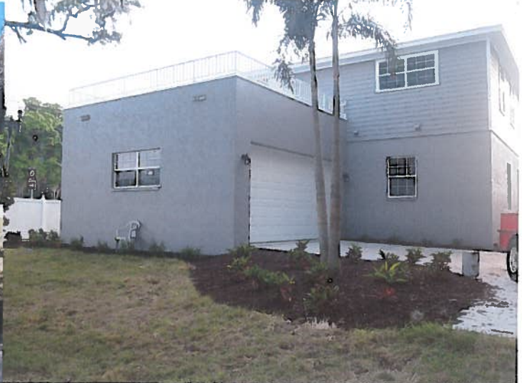
REAR VIEW 3/17/15