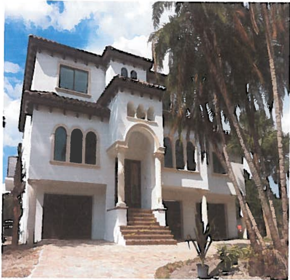
FRONT VIEW 10-11-2012

If using the Elevation Certificate to obtain NFIP flood insurance, affix at least two building photographs below according to the instructions for Item A6. Identify all photographs with: date taken; "Front View" and "Rear View"; and, if required, "Right Side View" and "Left Side View." If submitting more photographs than will fit on this page, use the Continuation Page, following.