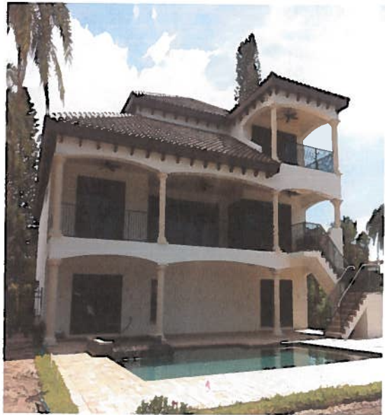
REAR VIEW 10-11-2012