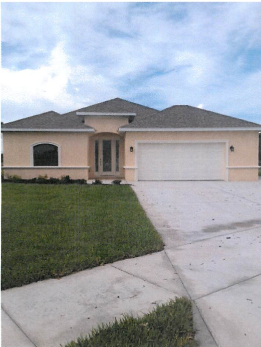
FRONT VIEW 8/22/13

If using the Elevation Certificate to obtain NFIP flood insurance, affix at least 2 building photographs below according to the instructions for Item A6. Identify all photographs with date taken; "Front View" and "Rear View"; and, if required, "Right Side View" and "Left Side View." When applicable, photographs must show the foundation with representative examples of the flood openings or vents, as indicated in Section A8. If submitting more photographs than will fit on this page, use the Continuation Page.