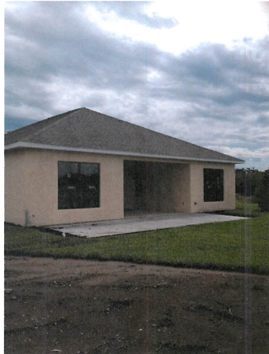
REAR VIEW 8/22/13