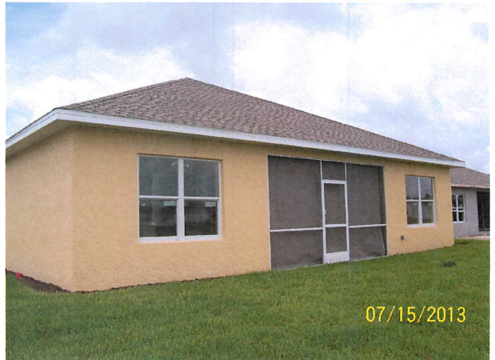
REAR VIEW 7/15/13