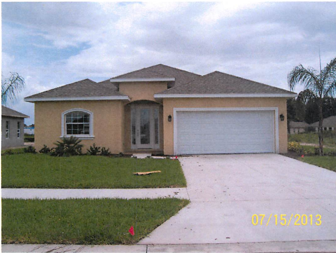
FRONT VIEW 7/15/13

If using the Elevation Certificate to obtain NFIP flood insurance, affix at least 2 building photographs below according to the instructions for Item A6. Identify all photographs with date taken; "Front View" and "Rear View"; and, if required, "Right Side View" and "Left Side View." When applicable, photographs must show the foundation with representative examples of the flood openings or vents, as indicated in Section A8. If submitting more photographs than will fit on this page, use the Continuation Page.