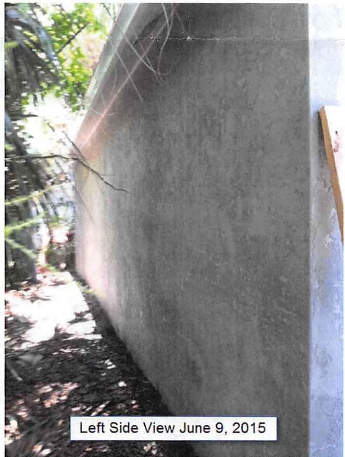
Left Side View June 9, 2015