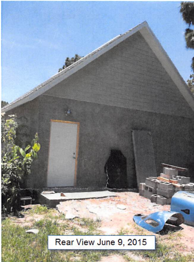
Rear View June 9, 2015

If submitting more photographs than will fit on the preceding page, affix the additional photographs below. Identify all photographs with: date taken; "Front View" and "Rear View"; and, if required, "Right Side View" and "Left Side View." When applicable, photographs must show the foundation with representative examples of the flood openings or vents, as indicated in Section A8.