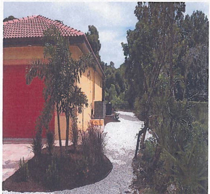
Right Side View Job # 14-1325