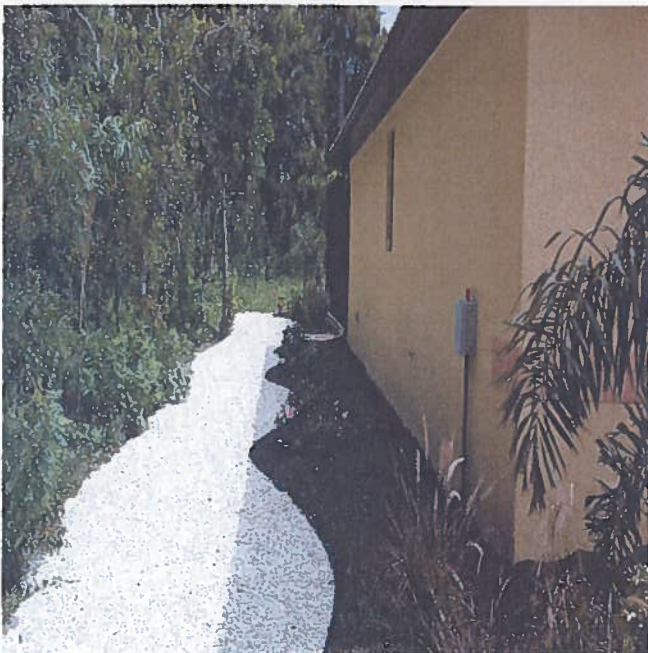
Left Side View Photographs Date Taken 9/14/2015