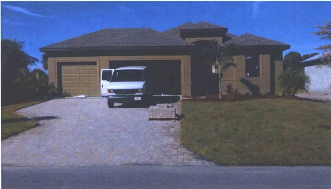
SOUTHSIDE OF HOUSE LOOKING EAST: