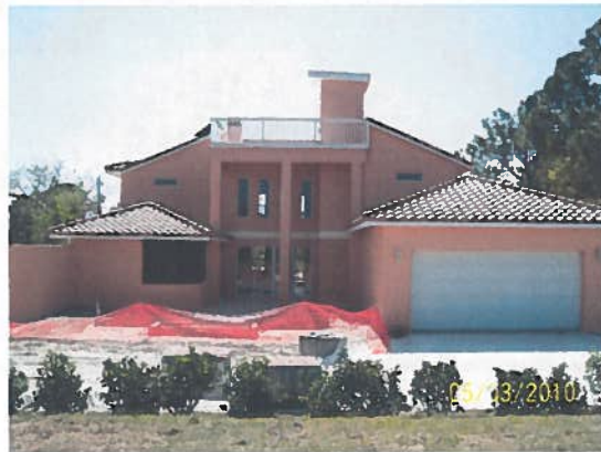
REAR VIEW 5-3-10