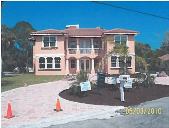
FRONT VIEW 5-3-10

If using the Elevation Certificate to obtain NFIP flood insurance, affix at least two building photographs below according to the instructions for Item A6. Identify all photographs with: date taken; "Front View" and "Rear View"; and, if required, "Right Side View" and "Left Side View." If submitting more photographs than will fit on this page, use the Continuation Page, following.