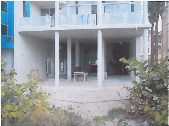
REAR VIEW 12/1/09