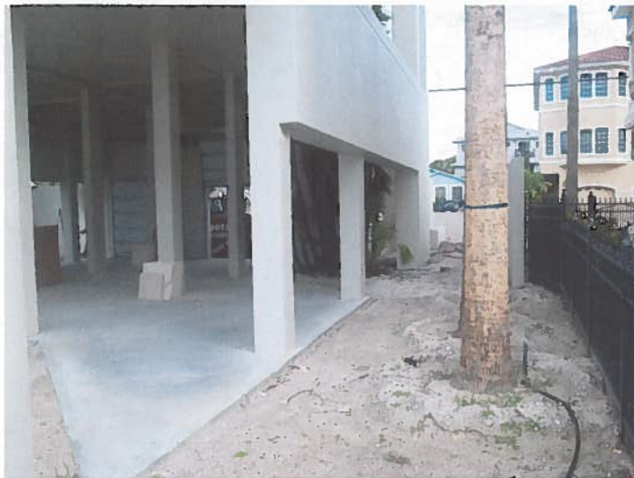
LEFT SIDE VIEW 12/1/09