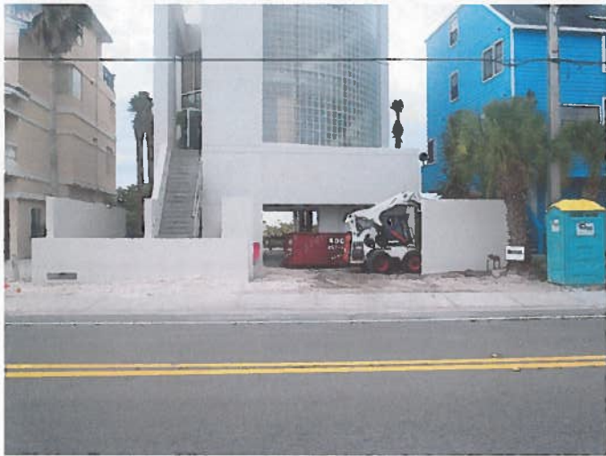
FRONT VIEW 12/1/09