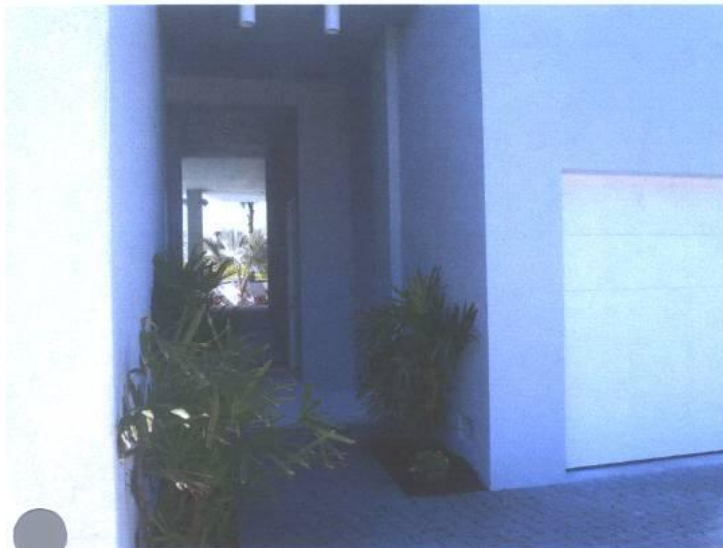
RIGHT VIEW 3/24/09