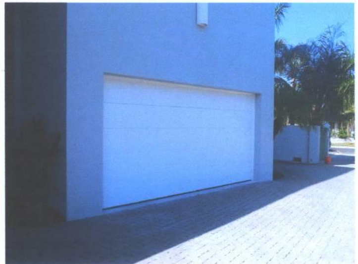
REAR VIEW 3/24/09