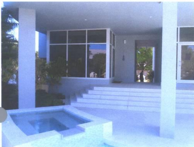
FRONT VIEW 3/24/00