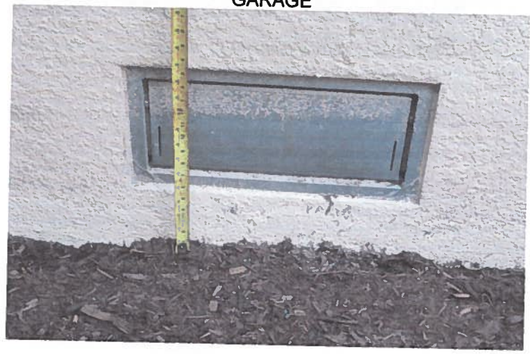
SMART VENT 1540-520