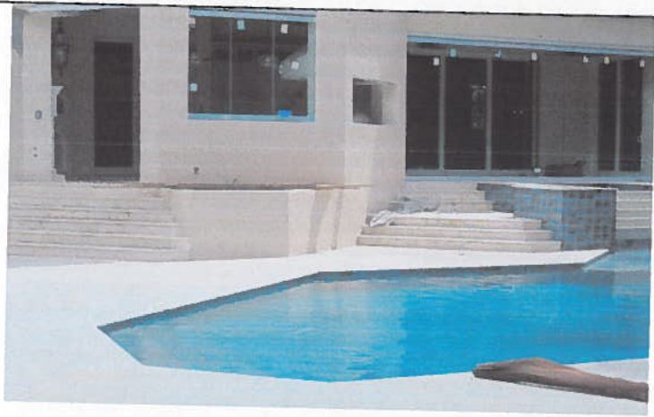
POOL AND DECK

If submitting more photographs than will fit on the preceding page, affix the additional photographs below. Identify all photographs with: date taken; "Front View" and "Rear View"; and, if required, "Right Side View" and "Left Side View." When applicable, photographs must show the foundation with representative examples of the flood openings or vents, as indicated in Section A8.