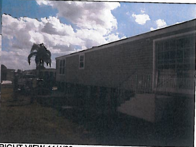
RIGHT VIEW 11/4/09