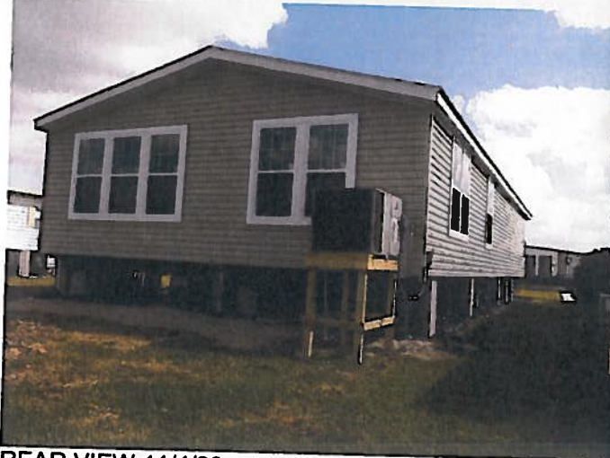
REAR VIEW 11/4/09