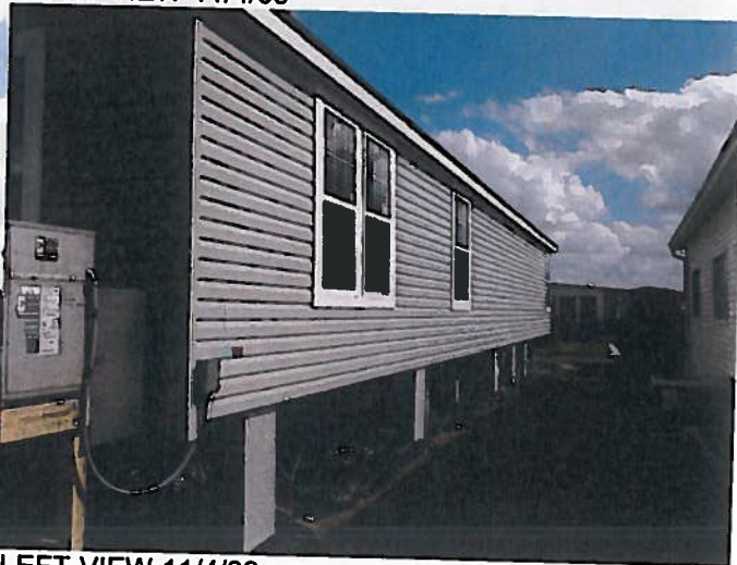
LEFT VIEW 11/4/09