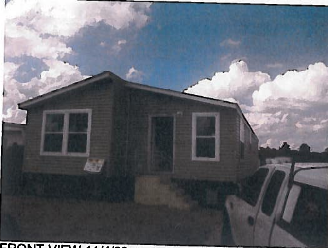
FRONT VIEW 11/4/09

If using the Elevation Certificate to obtain NFIP flood insurance, affix at least two building photographs below according to the instructions for Item A6. Identify all photographs with: date taken; "Front View" and "Rear View"; and, if required, "Right Side View" and "Left Side View." If submitting more photographs than will fit on this page, use the Continuation Page on the reverse.